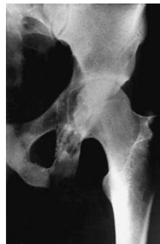
Fig. 1 Anteroposterior radiograph of the hip in 1975, showing a multilocular lytic lesion involving the ischium

Herein is reported a case of hydatidosis of the hip and pelvis with a follow-up of 25 years. We are not aware of any published case of this rare disease with such a long follow-up.