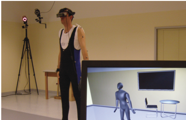
Figure 1. Subject wearing the HMD and markers was immersed in the movement analysis laboratory and consequently represented in the virtual laboratory.

A virtual laboratory environment was created in order to closely resemble the real laboratory with a human model (avatar) inside (Fig. 1 and Fig. 2). Subject position, measured by means of markers and optoelectronic system, was used to update the avatar position in real time, as well as to record subject's movements for offline analysis. The HMD was connected to the graphic workstation and was able to display the avatar point of view of the 3D virtual laboratory in real time (Fig. 2).