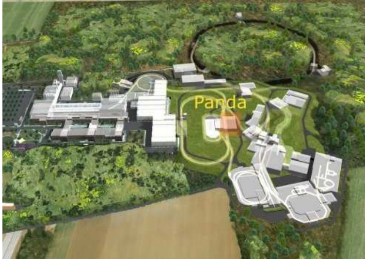
Figure 1: Aerial view of the future FAIR facility with the HESR (yellow color) and the PANDA hall (orange color).

The PANDA Physics programme [1] concerns not only charmonium spectroscopy but spans many different topics, all of them addressed to answer to fundamental questions of hadron and nuclear physics. Search for gluonic excitations, such as glueballs and hybrids, will be pursued in the charmonium region. Properties of mesons with hidden and open charm in the nuclear medium will be studied to understand the origin of hadron masses. Moreover, the open charm physics will be studied, measuring the rich spectrum of D mesons and their dominant and rare decays. Since in PANDA the \Xi and \bar{\Xi} hyperons will be copiously produced, it will be possible to generate double- \Lambda hypernuclei, which allow to study the Y-N and Y-Y interactions. Last, but not least, the study of nucleon structure will be investigated, by measuring Generalized Parton Distributions (Drell-Yan and Deeply Virtual Compton Scattering, "spin" structure functions by polarised \bar{p} and proton time-like form factors up to 25 GeV c.m. energy (never reached before).