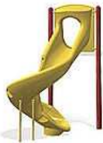
Figure 2: a twisted slide at the playground for an approach to energy

Another interesting aspect, which is becoming more evident with the development and the use of the platform, is the fact that the materials are accessible to all participants, independent from their school level, and this forces a particular attention to the continuity and consistency of approach between the different levels. An example is the approach to energy: one cannot propose to discuss the energy when playing on a twisted slide at the playground starting from definitions such as "energy is the capacity for doing work", because this might be fine at the High School level, but would not work for an elementary school teacher! This simple fact is now leading to a profound revision and to a debate on our approach to energy.