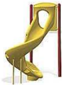
Figure 2: a twisted slide at the playground for an approach to energy

Another interesting aspect, which is becoming more evident with the development and the use of the platform, is the fact that the materials are accessible to all participants, independent from their school level, and this forces a particular attention to the continuity and consistency of approach between the different levels. An example is the approach to energy: one cannot propose to discuss the energy when playing on a twisted slide at the playground starting from definitions such as "energy is the capacity for doing work", because this might be fine at the High School level, but would not work for an elementary school teacher! This simple fact is now leading to a profound revision and to a debate on our approach to energy.