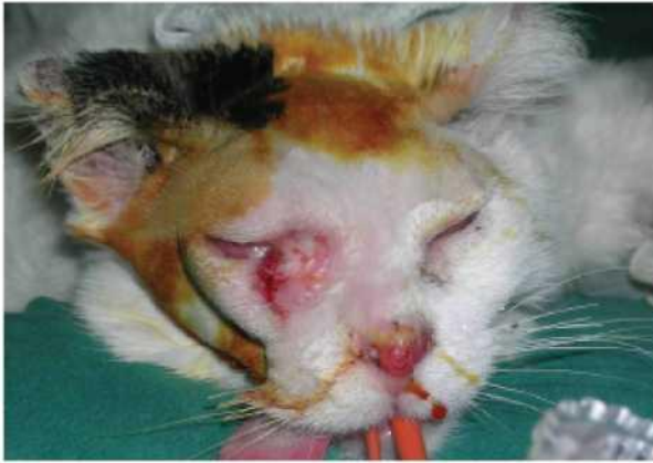
Figure 1 Pre-operative image of the FISS. An adequately wide surgical excision of the FISS would have led to the removal of the majority of both lids, the enucleation of the eye and reconstruction by a caudal auricular axial pattern flap or a superficial temporal axial pattern flap. The nasal planum is still erythematous, but no erosions, which were observed before treatment, are evident. The nasal deformity is a result of both the tumour erosive behaviour and the drug infiltration

monomorphic population of spindle cells immersed in an abundant hyaline matrix. The cells were characterised by indistinct borders, abundant cytoplasm and one paracentral nucleus with 1-2 prominent nucleoli, and a low mitotic index. A small central necrotic area and peripheral multifocal inflammatory infiltrates were present. Moderate and diffuse chronic inflammation was also visible in the perinodular dermis. The final diagnosis of a well-differentiated fibrosarcoma was confirmed with immunohistochemical staining for vimentin (monoclonal mouse anti-vimentin, diluted 1:50, DakoCytomation) and cytokeratin (monoclonal mouse anti-human cytokeratin clone AE1-AE3, ready to use, DakoCytomation) (Figure 3a, b). No further treatment was proposed.