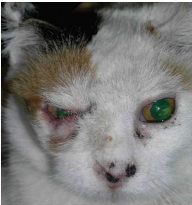
Figure 2 Clinical characteristics of the cat 1.5 months after surgery. Although the hair regrew near the eye, the cat did not seem to have any ocular problems. The crusty lesions of the nasal planum remained similar to the ones visible in the photograph for the rest of the cat's life.

Examinations of the nasal and periocular areas were planned every month for the first 3 months, and every 3 months thereafter, and radiographs of the thorax were planned after 6 months. The FISS recurred locally 10 months after surgery. The owner declined any further therapy and the cat was euthanased a few days after the last examination. Necropsy was not allowed; therefore, no information is available regarding the presence of metastasis, with the exclusion of the lungs and regional lymph nodes, which were clean on radiographs and at the clinical examination, respectively.