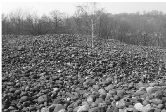
Fig. 2. Rounded cobbles and boulders accumulations on the Bessa aurifodinae upper terrace. Cumuli di ciottoli e di blocchi arrotondati sul terrazzo superiore delle Aurifodinae della Bessa.

Exploitations by artificial water-channel was carried out in contiguous but separate mining yards, everyone with a main deep evacuation channel (Bessa, Mazzè). This method produced two typology of reject deposits. Open-worked deposits of quite rounded cobbles and boulders (also erratic blocks), methodically accumulated in handmade piles 1-10 m thick on the terrace top in the site of the former placer (Fig. 2). Anthropogenic alluvial fans of clino-stratified clast-supported sandy-gravel with rounded pebble and cobbles, deposited downstream of the channel outlets on the lower alluvial plains surrounding the placer.