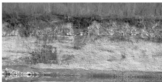
Fig. 3. Buried channel sidewalls outcrop at the top of a low terrace on the Dora Baltea River left scarp (Baraccone site, Villareggia). This anthropic horizon lies on Middle Pleistocene fluvial sandy gravel.

The minor placers corresponding to monophasic proglacial fans were exploited by simple excavations without water channels, owing to their distance from any water resource. This mining activity, partially explainable as research workings, is testified by the presence of hectometric wide areas only partially covered with cobble small piles and riddled with some meters deep cone-shaped pits (Frascheia near Villareggia and Moncrivello, Areglio-Bose and Madonna della Cella near Borgo d'Ale, Ronchi between Baldissero and Torre Canavese and other minor sites). Only for the Bessa and Mazzè sites running water was employed, probably because the aqueduct building cost (2 km long for Bessa and at least 10 km for Mazzè) was remunerative according to the placer extension and its higher gold grade.