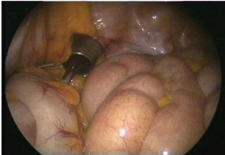
Fig. 2. A 12-mm port is placed through the vagina into the abdominal cavity, perforating the vaginal wall in the posterior cul de sac under direct vision.