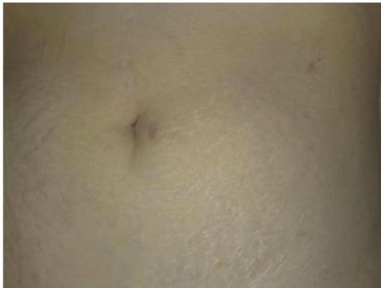
Fig. 6. Cosmetic results at 3 mo after a left natural orifice transluminal endoscopic surgery–assisted minilaparoscopic nephrectomy. Note the small scars at the level of the abdominal wall.