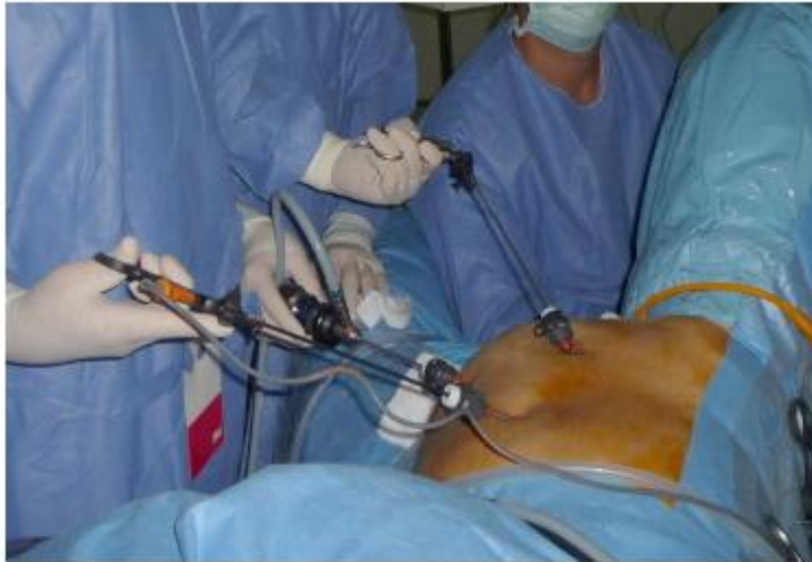
Fig. 3. Disposition of ports and surgeons during the procedure. The first surgeon uses 3-mm instruments placed through the abdominal wall, and the assistant works with instruments inserted through the 12-mm port placed in the vagina.