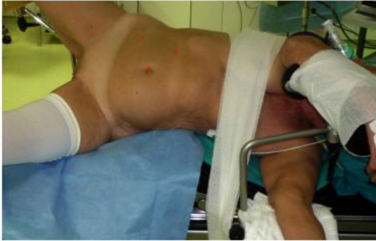
Fig. 1. Position of the patient during right transvaginal natural orifice transluminal endoscopic surgery–assisted minilaparoscopic nephrectomy. The patient is placed in a semilumbotomy position with separated legs to allow vaginal access. Red points indicate the sites of port placement.