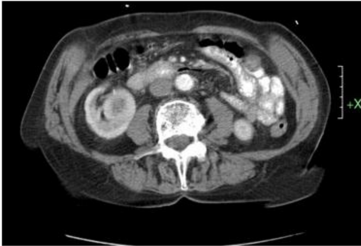
Fig. 5. Computed tomography scan shows right renal tumour with totally intraparenchymal growth. Pathology revealed a pT1b renal cell carcinoma.