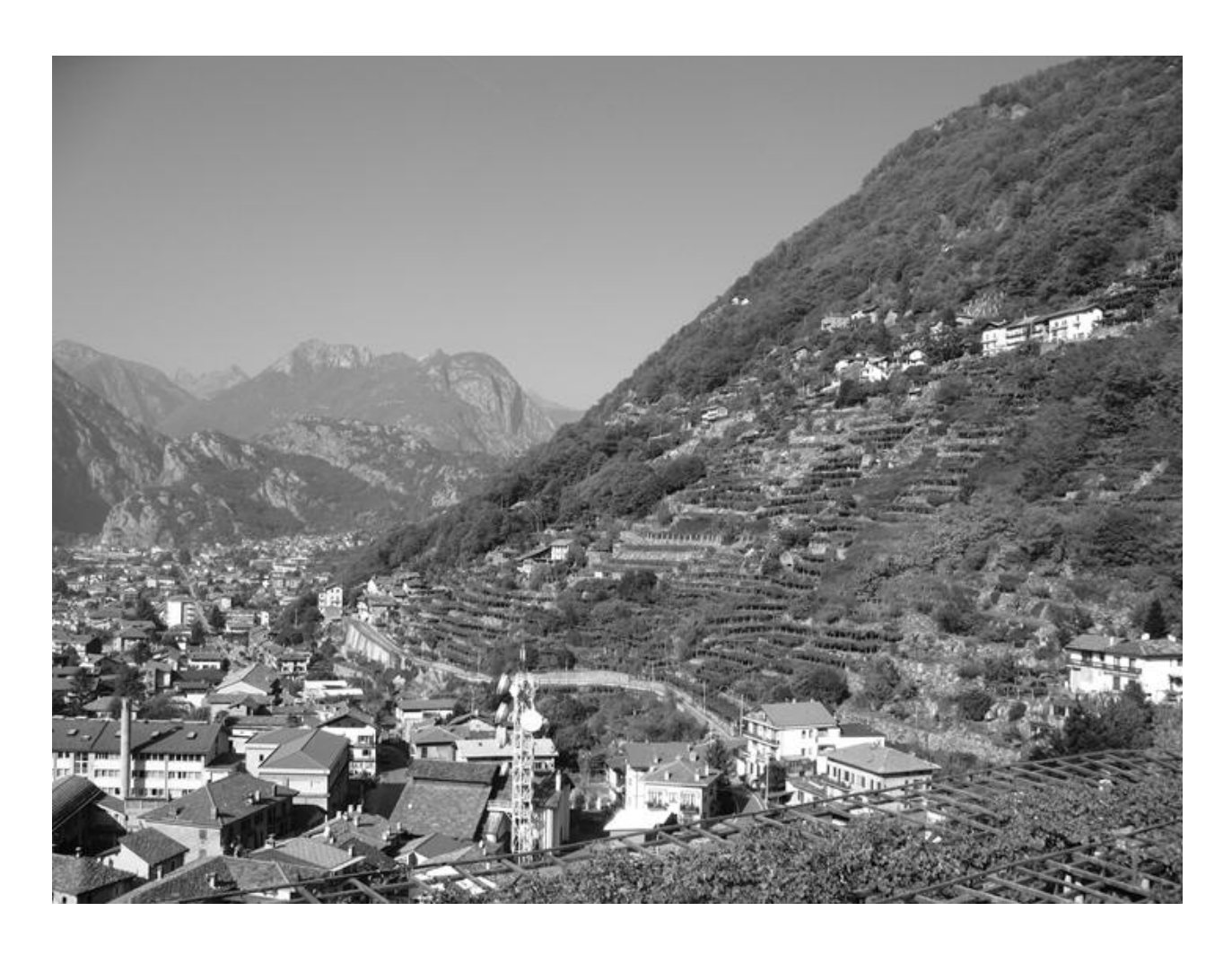
Figure 2: terraced slopes in Valle d'Aosta. Structural typologies and details. a) wall foundation; b) connection between terraces; c) example of restored wall; d) terraced slope - vineyard; d) terraced slope - chestnut wood; e) detail of wall structure