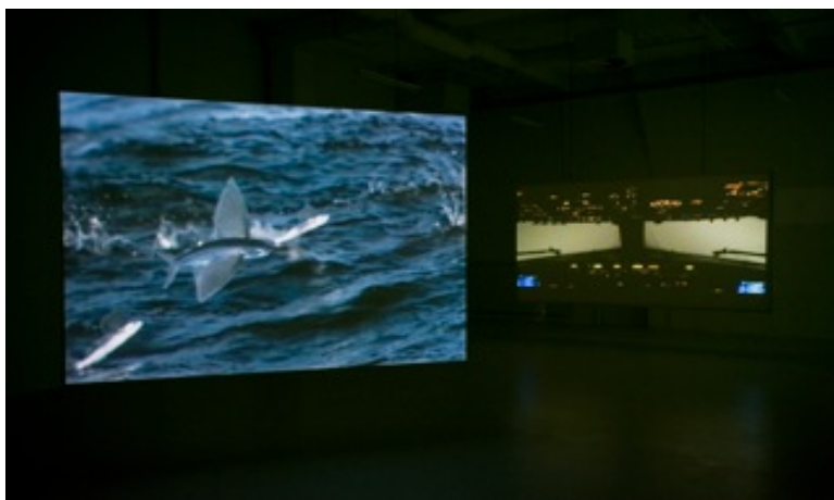
Figure 1. The Depth of the Surface : Installation view, Morten Skriver/Jesper Hoffmeyer 2011.

My favorite of these texts is called The Depth of the Surface . Maybe this is because this concept was so new to me when Jesper presented it during our planning, but more probably because it also relates so