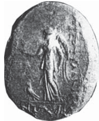
FIG. 3. Seal impression of the chreophylax from Uruk.

We have to look further East, towards Bactria or Gandhāra, to find substantial differences in design and execution, although the general theme of the coronation stays unchanged. One seal