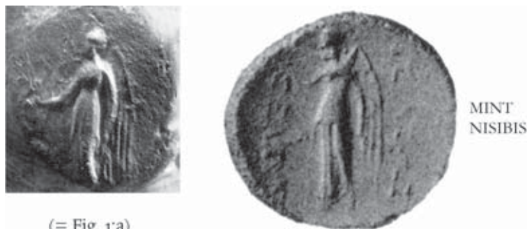
(= Fig. 1:a)