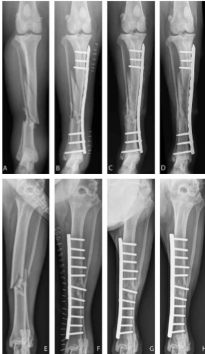
Fig.1 Radiographic sequence (A-D) of a 10-year-old German Shepherd dog (pair 4 in the minimally invasive plate osteosynthesis group) presented with a comminuted fracture of the tibia (A). The fracture was stabilized with a 14-hole broad LCP secured with three locking screws in each bone segment (B). Radiographic follow-up at (C) 30 and (D) 60 days shows the progression towards complete fracture healing. (E-H) Radiographic sequence of a 10-year-old mixed breed dog (pair number 4; open reduction and internal fixation group) presented with a comminuted fracture of the tibia (E). The fracture was stabilized with an 11-hole broad DCP secured with eleven cortical screws (H). Radiographic follow-up at (G) 30 and (H) 60 days shows progression of fracture healing.