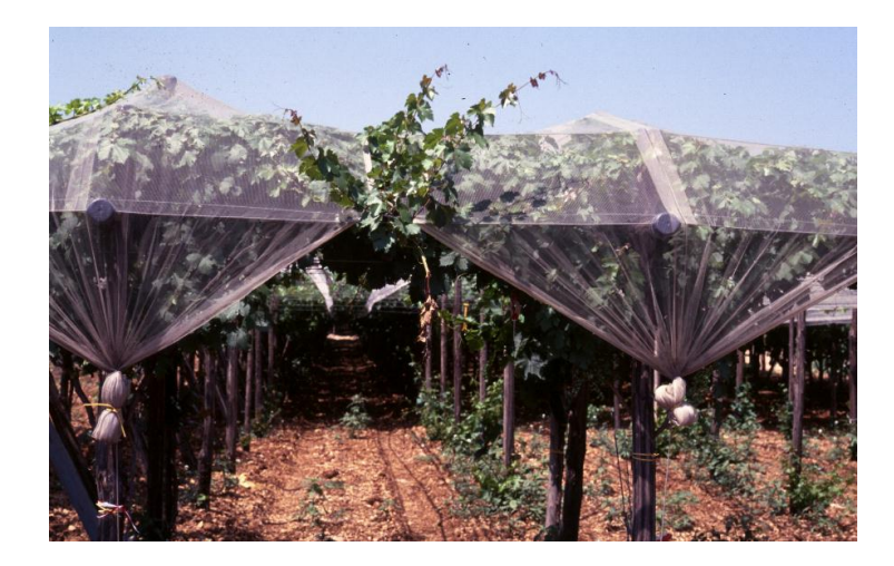
Fig. 3 – Hail net on cv. Michele Palieri grown in Southern Italy (Apulia).

In Turkey, in order to delay harvest and reduce grey mold disease in pre- and post-harvest of cv Sultani Cekirdeksiz, green nets having different shading density (35, 55 and 75%) were applied from veraison to harvest, combined with plastic films that were set up before the late-summer rainfalls; the best protection was obtained with 55 % shading net (Cangi et al. , 2011).