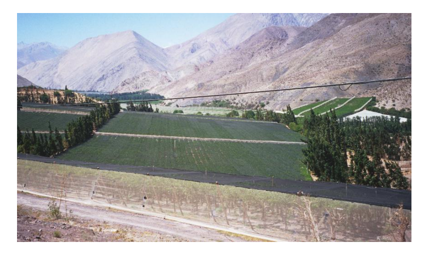
Fig. 2 – Net-houses on vineyards in Chile.

In highly windy environments, vineyards may be completely closed by nets; different net colour can be used: i.e. black or green nets on the top, to protect from direct solar radiation, and white net around the laterals, to facilitate the entry of diffuse radiation (fig 2).