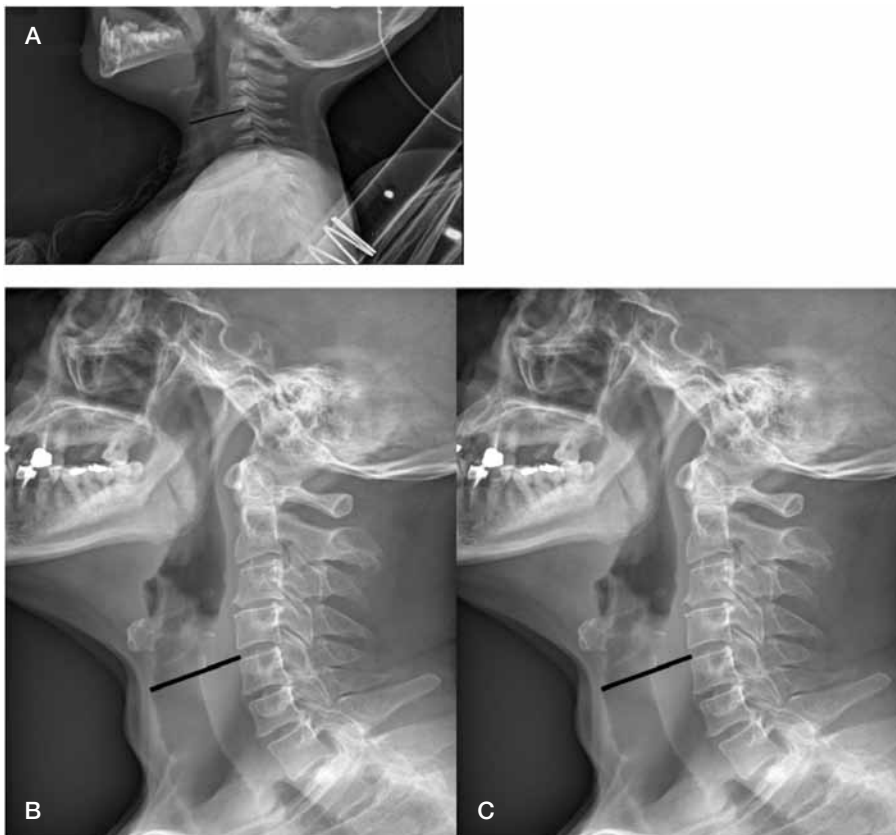
Fig. 3. Videofluorography during the respiratory phase in a newborn (A), in a normal elderly subject (B), and in an elderly patient who had undergone SCPL-CHEP + A (C). The line is placed at the level of the lower edge of the cricoid plate.

In this way, it is possible to explain the low incidence of AP episodes observed during long-term follow-up and the fact that the clinical evaluation of pulmonary function of patients at last follow-up was still satisfactory (no cases of dyspnoea at repose, only four patients with a Karnofsky score less than 80, two patients with a Karnofsky score less than 70). After discharge, 13 episodes of AP were observed, which occurred in only eight of 80 patients. Overall, three episodes of AP occurred in the last 3 years and 10 in the previous 12 years, nine of which occurred in the first 3 years after surgery. In our opinion, this is related to the adoption by physicians and patients of measures to reduce the risk of aspiration (placement of temporary gastrostomy for patients suffering from severe dysphagia, prolonged and repeated chest therapy and swallowing rehabilitation, elimination of at-