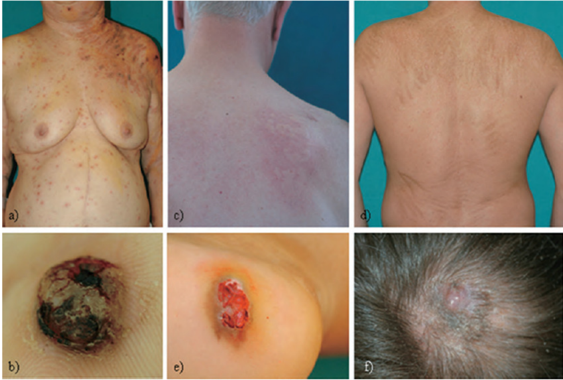
Figure 3.—Infectious dermatoses: A) left shoulder herpes zoster with disseminated lesions; B) giant viral wart localized in the palm of the left hand. Adverse drug reactions: C) urticarial reaction to rituximab localized at the site of cutaneous NHL lesions; D) bleomycinrelated flagellate dermatitis. Skin tumours: E) acromic nodular phase of a superficial spreading melanoma of the scalp, Breslow thickness 8.8 mm; F) ulcerated acral lentiginous melanoma of the foot, Breslow thickness 3.5 mm.