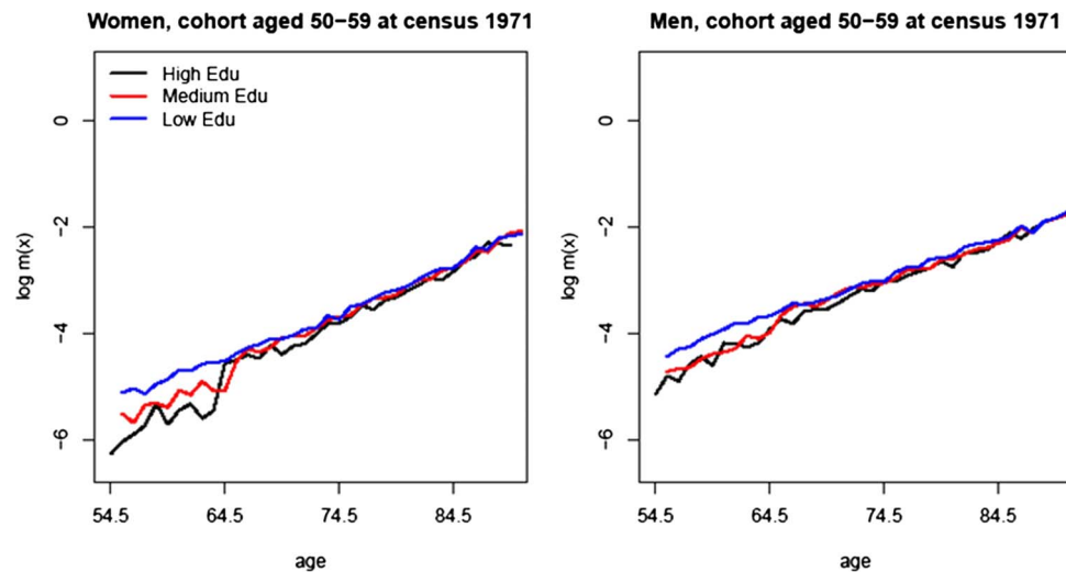
Figure 1 Death rates on logarithmic scale for the birth cohort aged 50–59 at the beginning of the follow-up (1971) by three education levels: high, medium and low.

3 years each (1971–1973, 1974–1976...), while in the model with frailty, for computational reasons, the number of variables was reduced to two broader periods: 1971–1990 and 1991–2007.