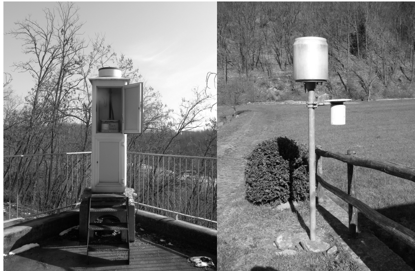
Fig. 1: (left) Photos of rain gauge used by SIMN to measurement the rain; (right) Photo of rain gauge utilizing by ARPA Piedmont.

In 2002, a national law has forced the unification of the meteorological networks owned by the SIMN with those of the ARPA. Because the ARPA network was more modern, ARPA has decided to discontinue the SIMN stations after unification for reasons of technological innovation and cost-effectiveness.