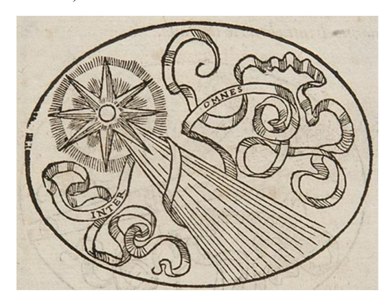
Figure 1. Inter omnes from Giovio [16]

A perfect case in point is the device of Cardinal Ippolito de' Medici (Figure 1), a famous composition that Giovio [15] praised and that all the other scholars quoted for its "perfection"<sup>5</sup>: it simply showed a comet accompanied by the Latin motto Inter omnes , in fact a quotation from Horace's Odes I, 12 ( micat inter omnis / Iulium sidus velut inter ignis / luna minores ).