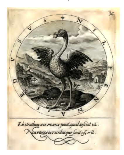
Figure 3. from Rollenhagen [28]

(Figure 3) combines two existing devices<sup>21</sup> to discuss the nature and role of the writer, as the subscriptio makes clear (you cannot be considered a writer only because you have a pen, just like the ostrich, who has wings and feathers but does not know how to use them).