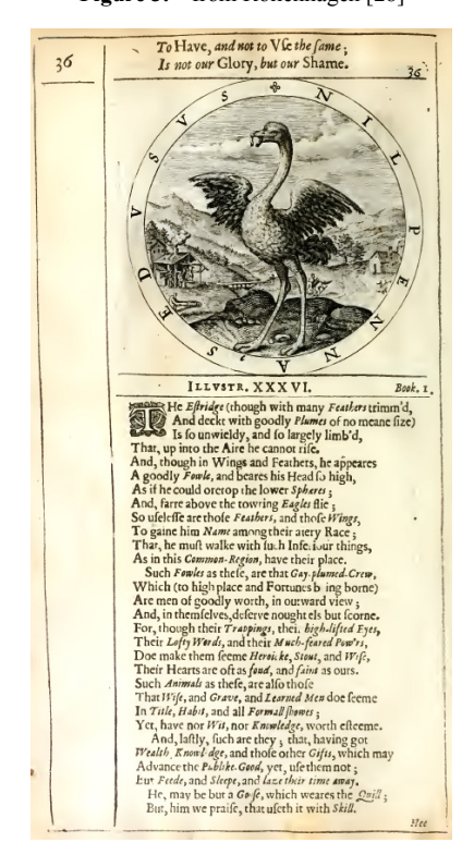
Figure 4. from Wither [36]

life. For a detailed discussion of the symbology of the ostrich see, for example, Giovio (1574: 93-97), Camerarius (1597: 17-19) and Ferro (1623: 677-79).