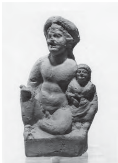
Fig. 3. Seleucia on the Tigris, nude squatting child and standing draped figure. Terracotta. (13,8x7,4 cm; Menegazzi 2014: 11.S152)