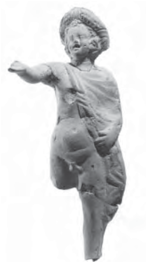
Fig. 2. Seleucia on the Tigris, semi-nude standing child. Terracotta. (16,7x6,5 cm; Menegazzi 2014: 11.S14)