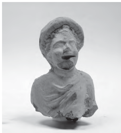
Fig. 4. Seleucia on the Tigris. Torso of a child. Terracotta. (7,1x4,8x3 cm; Menegazzi 2014: 11.G119)

with left leg bent on the floor and right knee drawn up. The head, turned toward right, is crowned by a floral wreath. The hair are shoulder-length; the forehead is frown, and the hollow mouth is large. On his left side stands a draped figure of smaller size, with frontal head and torso, left arm on the side and right arm folded to the chest, holding an attribute in the right hand 13 (fig. 3). Its interpretation is uncertain: the round face, the full cheeks and the hairstyle — with the hair gathered in a low ponytail — are compatible with the representation of a child. On the other hand, the hairstyle is also typical of dwarfs, and the open knees — visible under the drapery of the mantle — are consistent with this reading 14 . The semi-nude standing boy finds a precise correspondence in the coroplastic repertoire from Myrina 15 ; conversely, for the latter iconographic type we were not able to find a parallel — either in the Mesopotamian or in the Mediterranean terracotta production — that could shed some light on the identity of the standing figure and the meaning of the group.