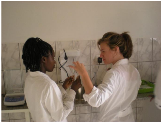
Fig. 4: Angola, Funda, A.M.E.N. Medical Center.