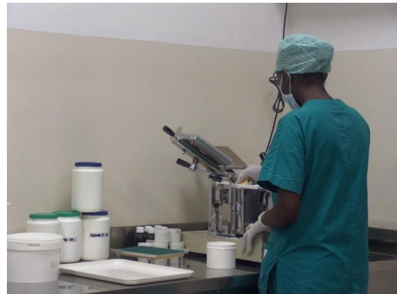
Fig. 5: Cameroun, Garoua, "Notre Dame des Apôtres" Hospital.