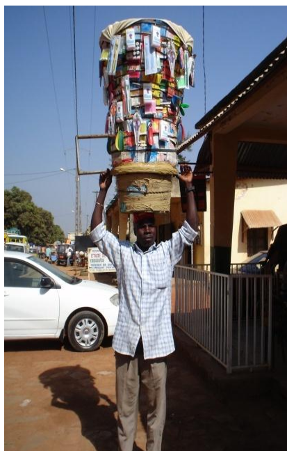
Fig. 1: Cameroun, street pharmacist.