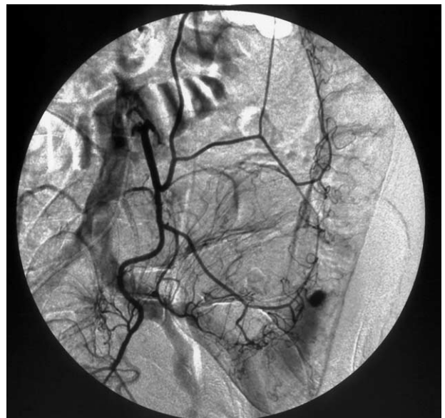
FIGURE 2. Transcatheter arterial embolization of colonic diverticular bleeding.

be required. 32 In 13.8% of the cases, an urgent colectomy becomes necessary, but is burdened by high mortality and morbidity rates (20%). 18 In all the analyzed studies, urgent colonoscopy was performed to achieve the diagnosis of