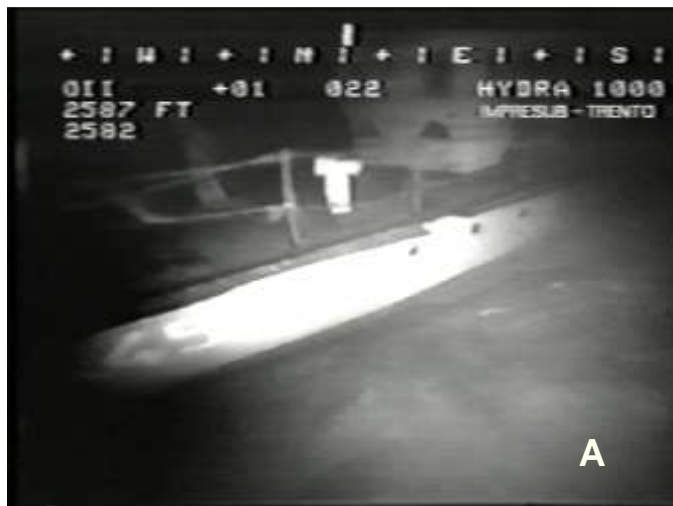
Fig. 1 – A) The Kater Radez I relict found at the sea-bottom of the Otranto Canal by SROT. B) The relict rescued from the seabed by a yellow sub-marine module specifically designed