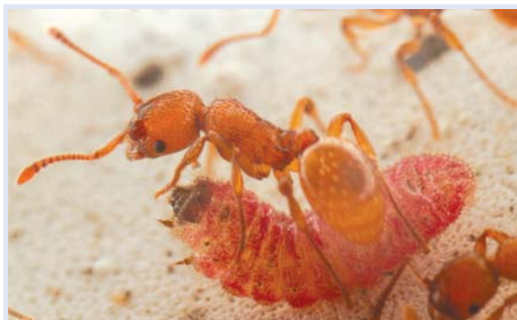
Figure 1. A worker Myrmica scabrinodis in its nest feeds a larva of the butterfly species Maculinea alcon .

In addition to analyzing the similarity of the sounds emitted by Maculinea and Myrmica , we observed the behavior of the ants to better understand the role of acoustical emissions in the ant–butterfly relationship. Not surprisingly, playback experiments