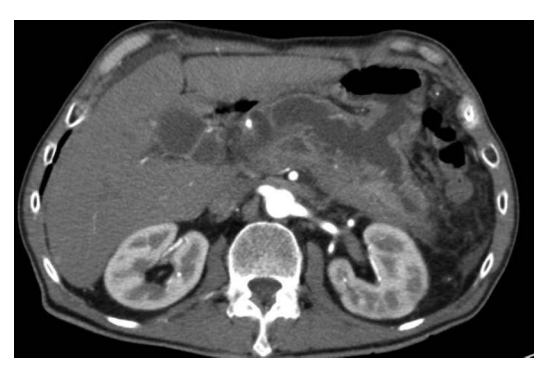
Figure 1 CT scan showing gastropancreatic fistula.

To cite: Morotti A, Busso M, Rappa Verona P, et al. BMJ Case Rep Published online: [please include Day Month Year] doi:10.1136/bcr-2016-215375