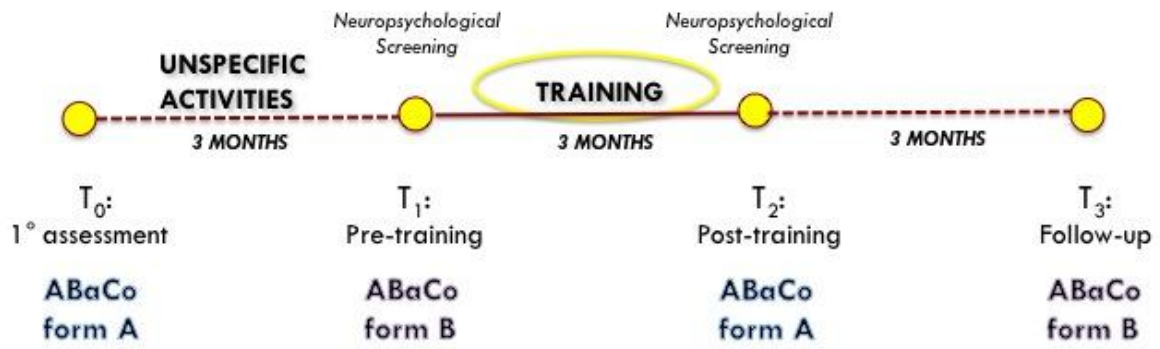
Figure 1. Graphical representation of the experimental design