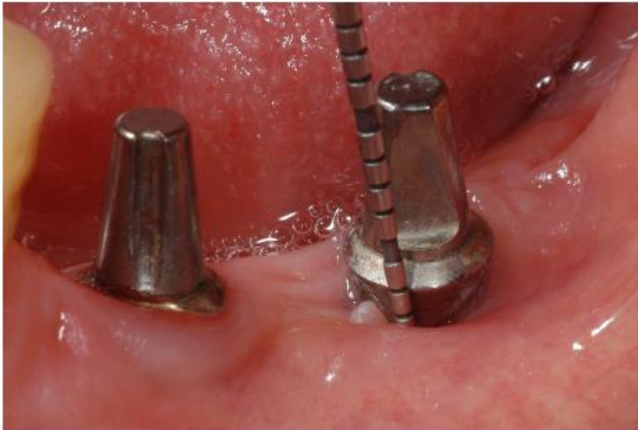
Fig. 2. At 2-year follow-up: patient reports discomfort when performing plaque control around distal implant. Soft-tissue graft is scheduled to increase tissue thickness