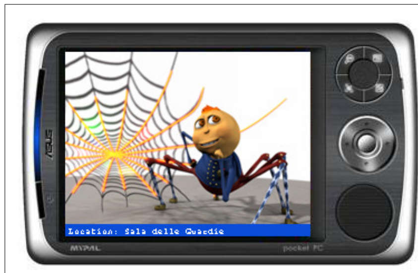
Figure 1. “Carletto the spider”.

the system evaluation, carried out through 300 anonymous questionnaires and an ethnographic observation, demonstrated that people, on the one side, liked Carletto and were emotionally engaged with his story, and, on the other, were quite satisfied with the content delivery, also in comparison with the human and the audio guides, respectively (Damiano et al. 2008).