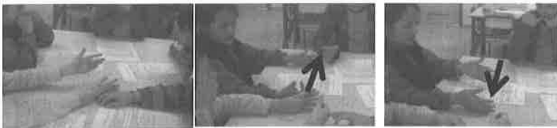
Figure 2. (a) Two hands gesture a span. (b-c) The shared gesture of weaving and unraveling a span.

DAVIDE: ( interrupting ) A half was always left.