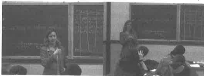
Figure 4a-b. The teacher's gestures in the semiotic game.

TEACHER: Real. And do the two sequences coincide? (Fig. 4b).