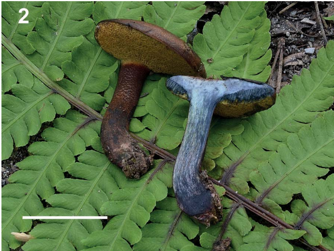
Fig. 2. Boletus sinopulverulentus . Basidiomata in habitat (from HMAS 266894, holotype). Bar: 20 mm.

Spores: [50,1,1](9.0)12.5±1.00(14.3)×(4.8)5.4±0.28(6.0)µm, Q=2.31±0.14, V=194 ± 32.0 µm 3 , asymmetric, elliptical to ellipsoid-fusiform in side view, elliptical in face view, smooth, with a long apiculus and a markedly pronounced supra-apicular depression, often very faintly constricted to-