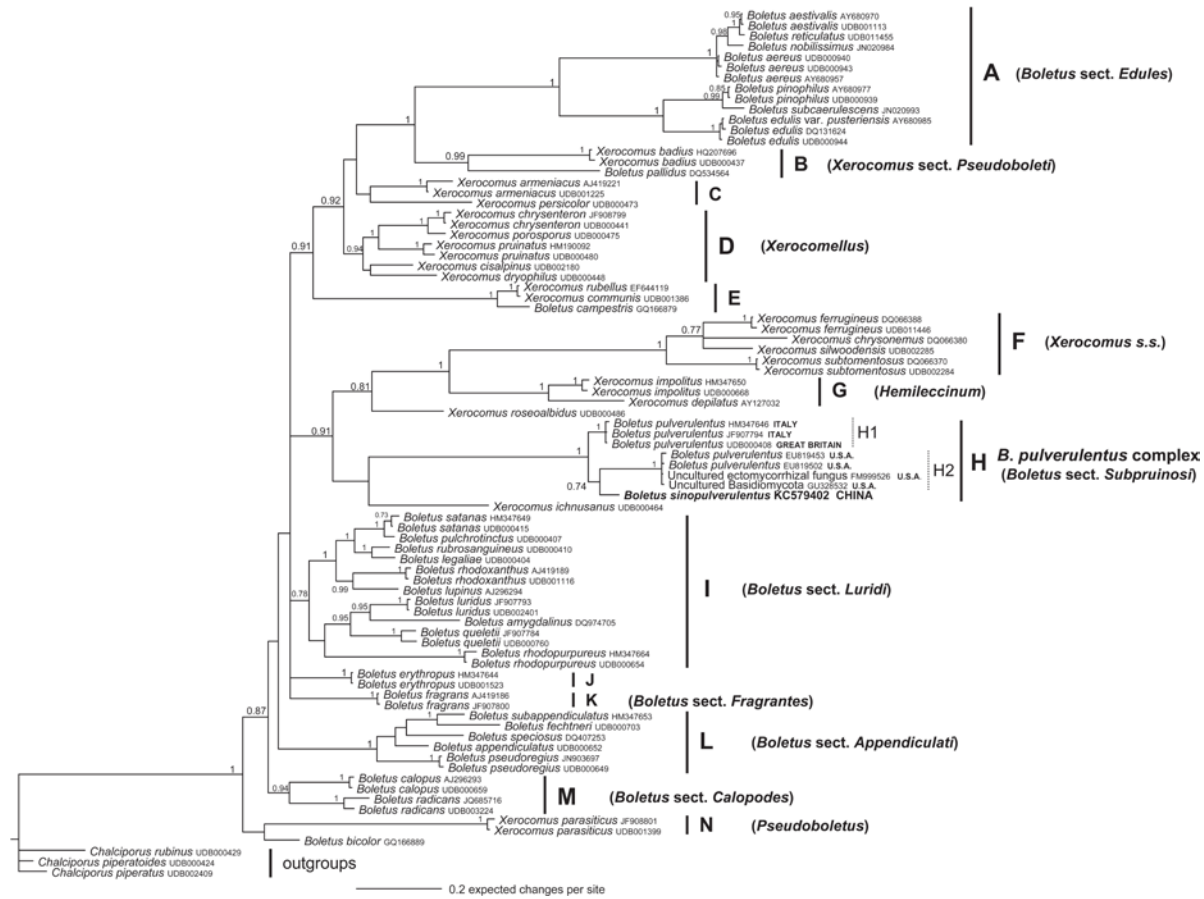
Fig. 1. Bayesian phylogram obtained from the ITS (ITS1-5.8S-ITS2) sequence alignment of Boletus and Xerocomus spp. BPP values over 0.70 are given above branches.