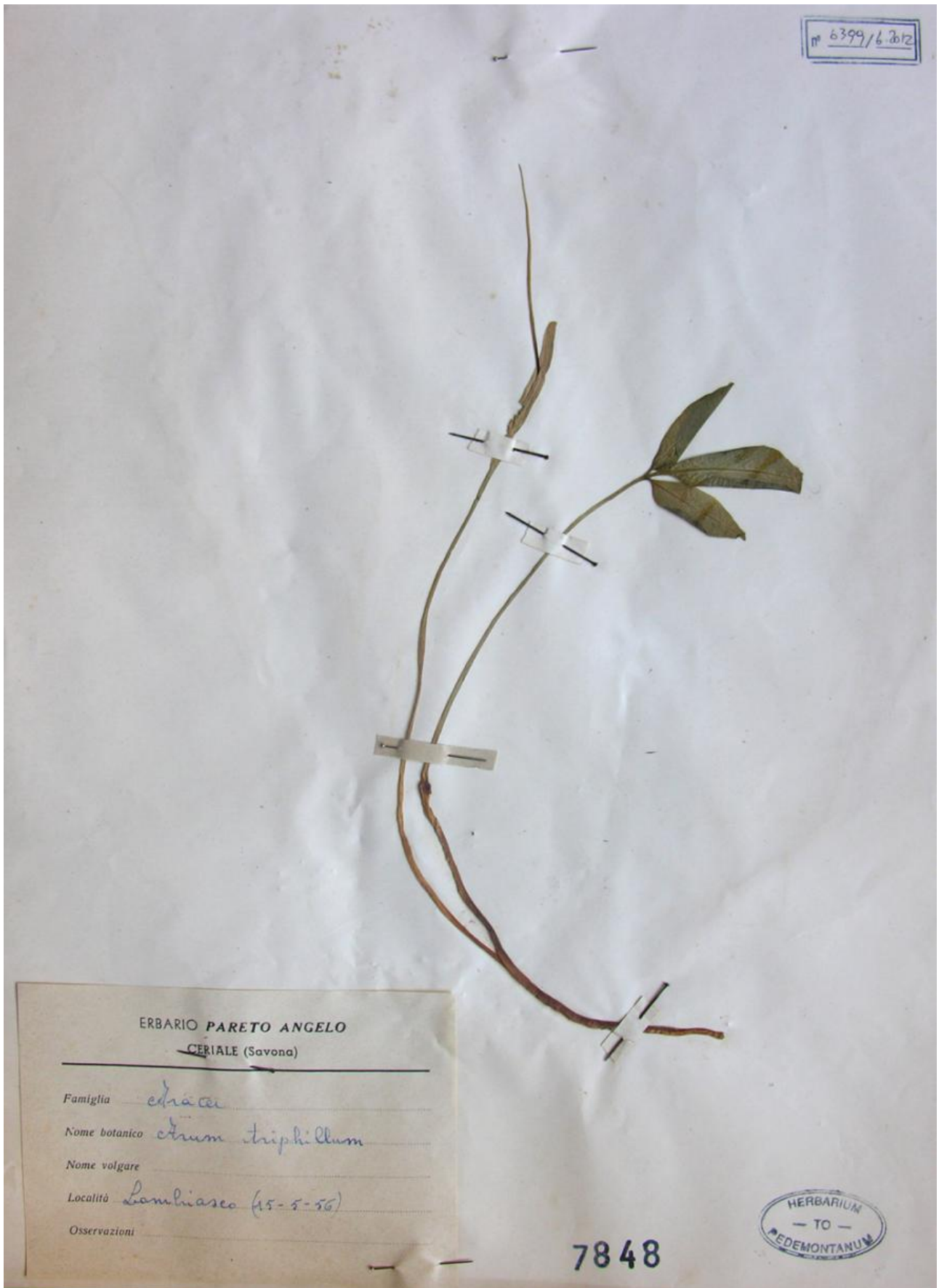
Figure 5. Herbarium specimen of Pinellia ternata (sub Arum triphyllum ) newly acquired in TO, collected in 1956 by A. Pareto near the River Po at Lombriasco (Province of Turin).