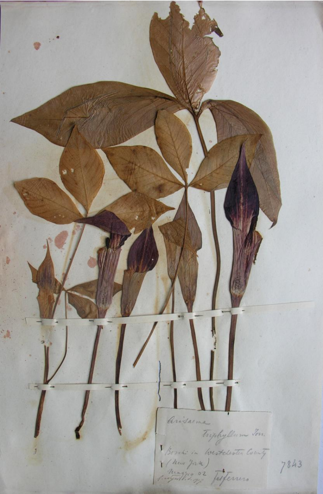
Figure 4. North American herbarium specimen of Arisaema triphyllum conserved in TO, collected by Felice Ferrero (02/05/1907).