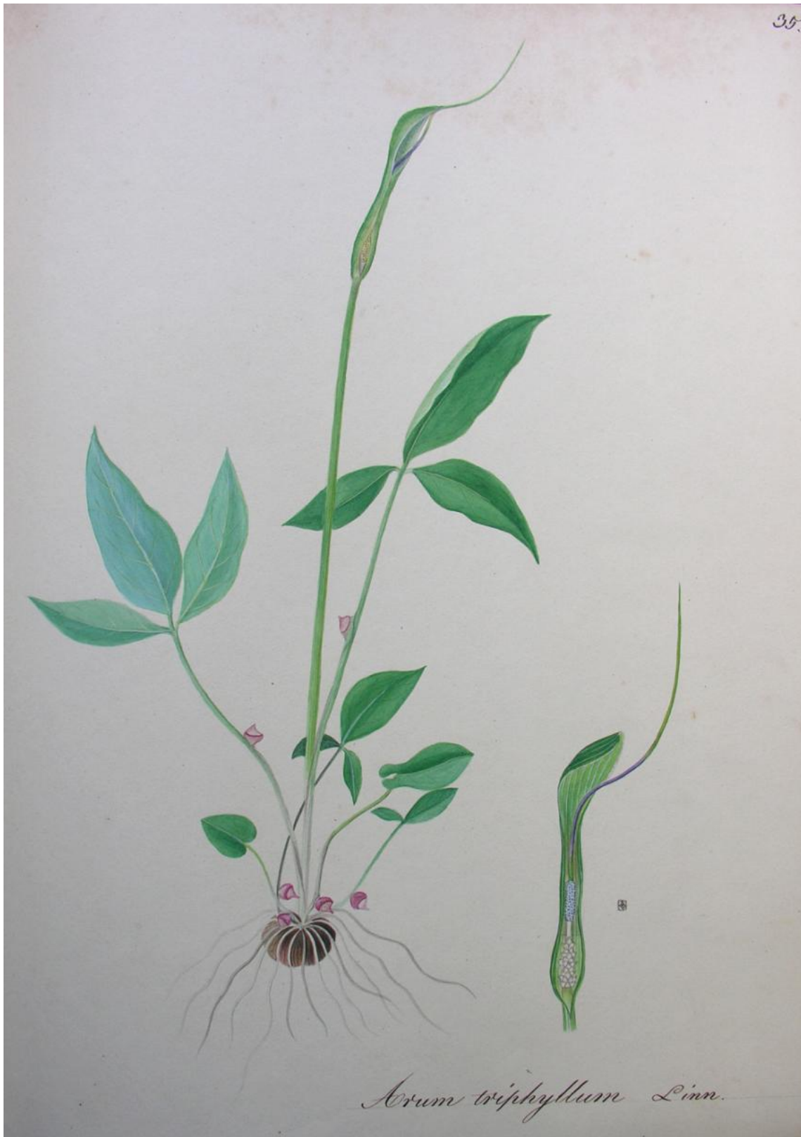
Figure 3. Illustrated plate of Pinellia ternata (sub Arum triphyllum ) from Iconographia Taurinensis (t35, vol. 55) conserved in the Library of Department of Life Sciences and Systems Biology (University of Turin).