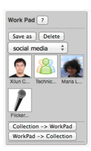
Figure 4. Two different work pads of the same user: the work pads can contain many different types of resources, including avatars of the users, presentations, sessions, questions and answers, documents, and collections. The work pads serve both as a book mark as well as context for search and recommendations

To support services where the activity context is determined by external materials, we apply novel concept map bootstrapping algorithms that rely on user highlights, bookmarks, notes, or documents. These algorithms, including [10], extract, in a semi-automated manner, dominant concepts and their relationships specific to a given material.