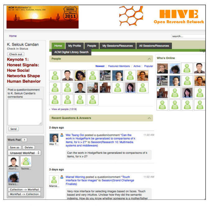
Figure 1. A screen shot from the MM'11 edition of the Hive open research network

Copyright is held by the authors. EDBT/ICDT '13, Mar 18-22 2013, Genoa, Italy ACM 978-1-4503-1597-5/13/03.