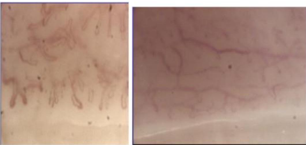
Fig. 3. Scleroderma pattern late . Capillary loss, fibrosis and intensive angiogenesis.