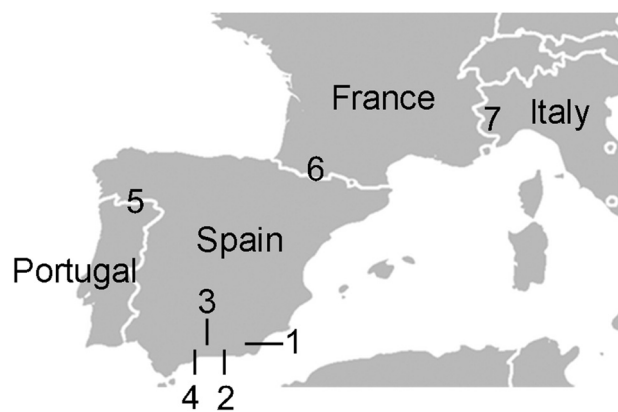
Figure 1. Distribution of the study sites. 1: Sierra Nevada Natural Space for Capra pyrenaica hispanica ; 2: Sierra Mágina for C. p. hispanica ; 3: Sierras de Tejada y Almajara for C. p. hispanica ; 4: Sierra de Loja for C. p. hispanica ; 5: Sierra Sur de Antequera for C. p. hispanica ; 6: Parque Nacional de Peneda-Gerês – Baixa Limia and Serra do Xurés Natural Park for Capra pyrenaica victoriae ; 7: Parc National des Pyrénées for Rupicapra pyrenaica ; 8: Parco Naturale Val Tronca for Rupicapra rupicapra and Capra ibex .

We used data from 21 field surveys carried out between 1995 and 2012 in the Parc National des Pyrénées (PNP), France, for Pyrenean chamois; Parque Nacional de Peneda-Gerês – Baixa Limia and Serra do Xurés Natural Park (PNPG), two adjacent and contiguous areas in northern Portugal and northwestern Spain, respectively, Sierra de Loja (SL), Sierra Sur de Antequera (SSA), Sierra de Tejada y Almajara (STA), Sierra Mágina (SM) and Sierra Nevada Natural Space (SN), southern Spain, for Iberian ibex, and Parco Naturale Val Tronca (PNVT), western Italian Alps, for Alpine chamois and Alpine ibex (Figure 1, Table I). These surveys accounted for a total of 1919.7 km of walked transect. The surveys were designed to sample at least 10% of the study surface area and transects were placed using a stratified sampling design (regarding orientation, slope, height and type of vegetation). For details in survey design, see Palomares and Ruiz-Martínez (1993) and Pérez et al. (1994). In Table I, we indicate the date (month and year) in which each survey was performed. Transects were sampled from 07:00 to 10:00 and