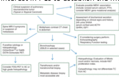
Figure 1. Algorithm for diagnosis of pulmonary neuroendocrine tumor.

Needless to say all patients should be discussed within a multidisciplinary tumor board with a specialist interest in PCs to establish the most appropriate management for patients (Figures 1 and 2).