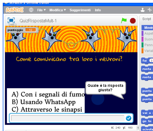
Fig. 3. “How do neurons communicate?”

This example has been shown in the meetings of the PP project with similar but much simpler activities. In fact for each activity type, because of the short time available, it was decided to start working on one or more canvases showing an example of the activity.