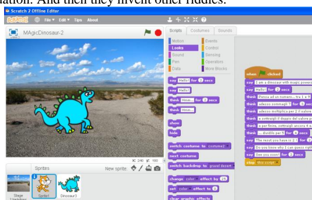
Fig. 2. "The magic dinosaur"

Retraining courses using Scratch are very well received by teachers because they appreciate the use of a simple tool through which you get rewarding results. Also teachers appreciate they are asked to work on activities fit to their students and with content that can be interesting for other disciplines and then for fellow teachers. Example of interdisciplinary activities are the programs "think a number ( and I guess it)" in which each group of students invents its own riddle through an experimental activity on linear equations. The Scratch activity is very simple: it is a sequence of instructions as shown in Fig. 2. The valuable part of the activity is once again, but particularly in this case, the phase where the students use the teacher's riddle, try to understand the inner working till when they get that the proposed riddle can be modeled by an equation. And then they invent other riddles.