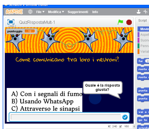
Fig. 3. “How do neurons communicate?”

This example has been shown in the meetings of the PP project with similar but much simpler activities. In fact for each activity type, because of the short time available, it was decided to start working on one or more canvases showing an example of the activity.