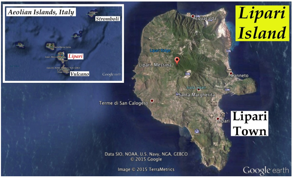
The Aeolian Islands and Lipari