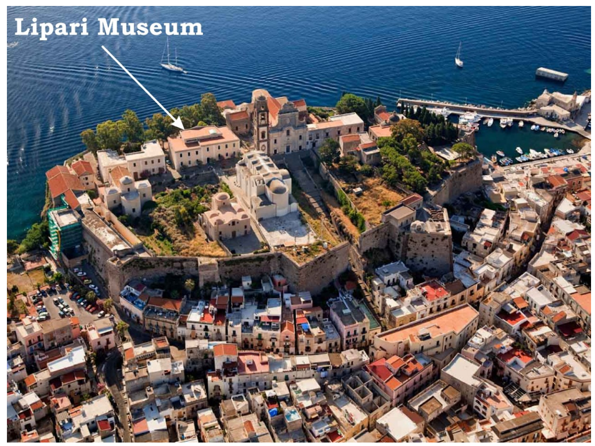
The Castello and Lipari Museum in the center of town of Lipari