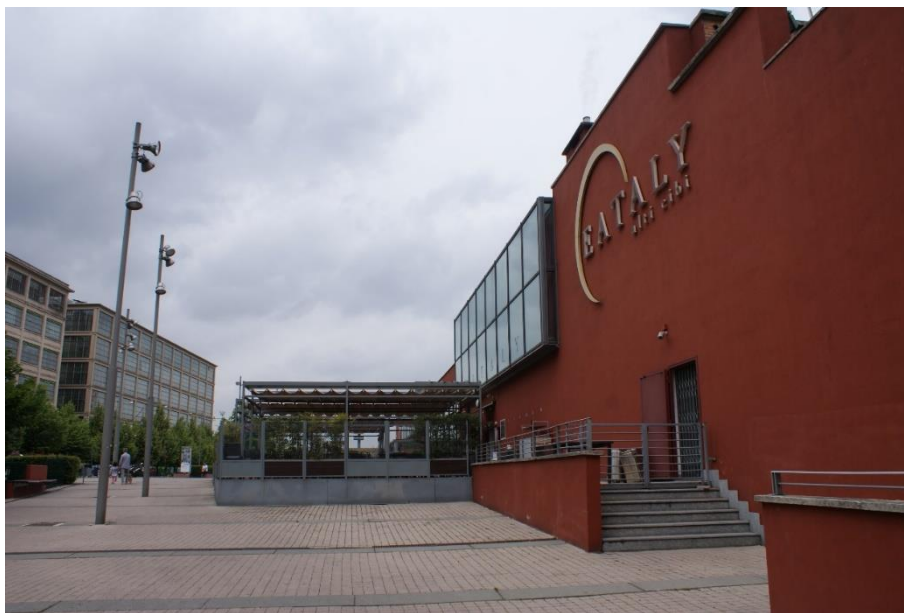
Figure 7. Eataly and Lingotto

The more recent element testifying this new spirit of capitalism is epitomized by Eataly, the now internationally famous brand of gourmet food. Today, in fact, high-quality, local, food products – for example, wine, chocolate and ice cream – are becoming highly popular, particularly for wealthy foreign consumers and tourists, and many local companies are expanding, thanks to the export of their goods in Italy and overseas. Generally speaking, food production and retail are perceived as a meaningful pillar for the economic recovery of the city, in a framework of diffuse industrial crisis (Vanolo, 2015b). In this framework, the old Carpano factory, which now hosts Eataly, has been converted as a highly symbolic cultural space related to the consumption of food. It is not just a place where to buy and eat food, but also to have a cultural experience of food: Eataly in Turin, as well as in its other branches, is in fact imbued with discourses, images and experiences that aim to incorporate in its consumers and visitors a culturally deep and cosmopolitan (and arguably expensive) experience of drinking and eating 'earthy delights' – genuine, local, artisanal food (Figure 7). The food mall also contains the museum of the Carpano factory and has been also enriched with arts as, for example, the installation 'Mare Mater', by Anna Paola Cibin, located 'between the fruit and vegetables and the fish sections'. 12