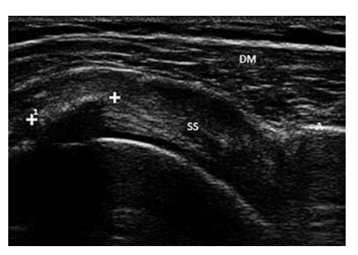
Fig 1. Calcification of the supraspinatus tendon with posterior acoustic shadow.

fined posterior acoustic shadow (type I calcifications) (fig 1) or as hyperechoic foci with a faint (type II) or absent (type III) shadow – "slurry" calcifications [1,19].