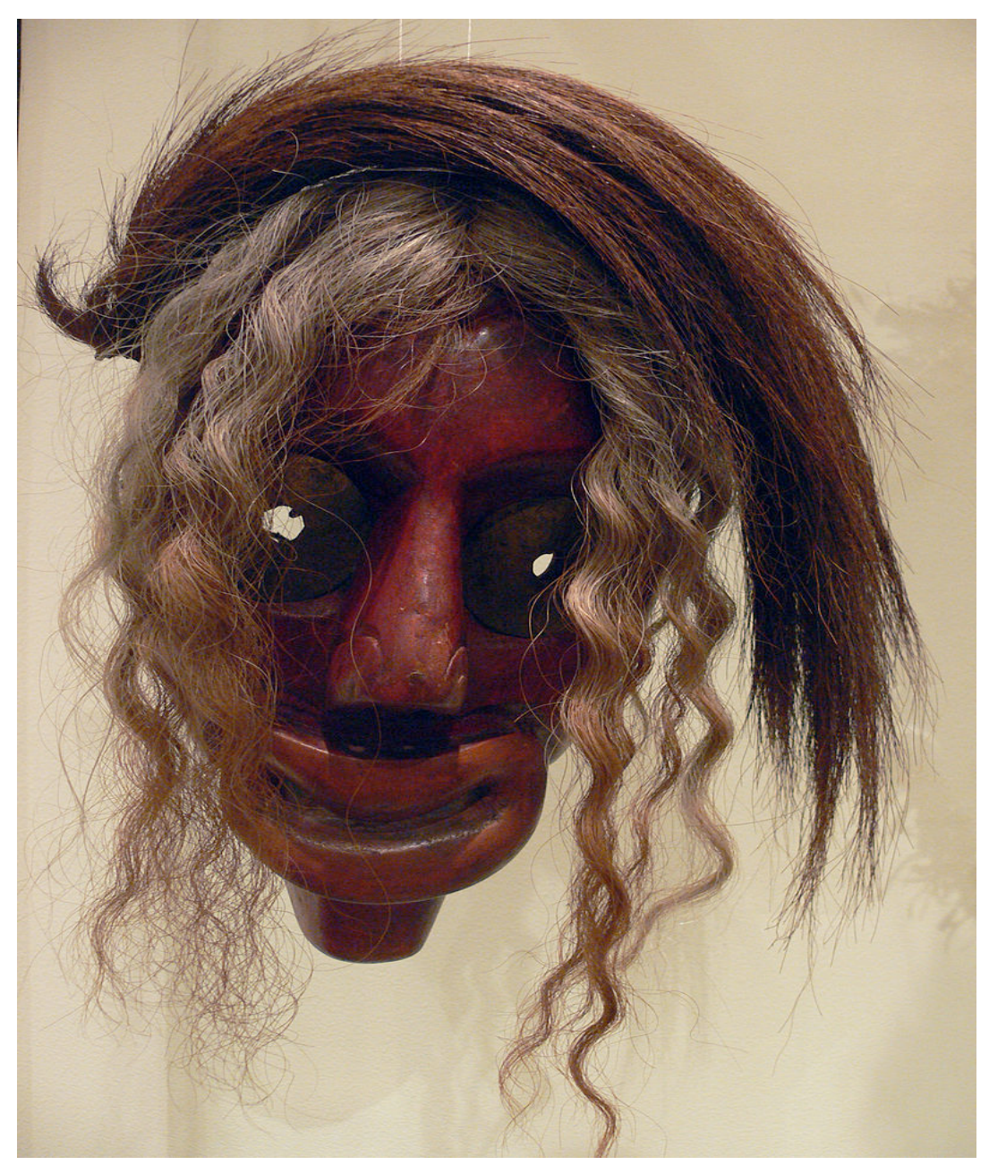
Fig. 13. Iroquois False Face Mask, Ethnological Museum Berlin

Alongside the False Faces often were another kind of masks, the so called Husk Faces, because they were twined from corn husks. Their wearers could handle hot coals and participated in ceremonies in conjunction with the Midwinter celebration. The tutelaries of the Husk Faces were agricultural spirits, associated with the corn harvest or with growing grains, not the spirits of the forest associated with the False Faces, although in many occasions they appeared together (Tooker 1978: 461). They corresponded to the two dimensions of the Iroquois natural world: the forest and the clearing. The forest was the domain of the men and of the tree spirits: the men cut the clearing out of the forest and constructed the village using materials taken from the forest. Once this was