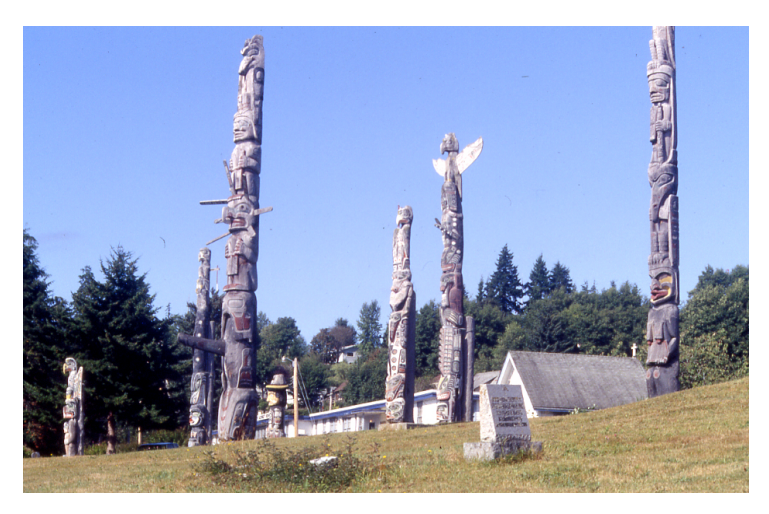
Fig. 6. Totem poles, Alert Bay village