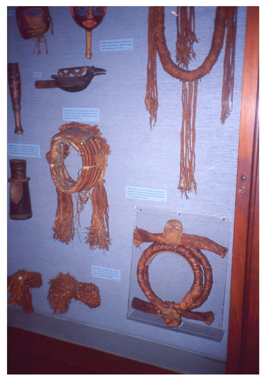
Fig. 9. Cedar bark ornaments for the ritual initiation of the Cannibal Dancer. American Museum of Natural History, New York

The hemlock branches were worn by the candidates without particular elaboration, they were simply twisted around the waist, the head, the ankles and wrists of the initiate. The cedar bark ornaments were the product of a long process: the bark was taken from the trees and put into fresh water to soften, then beaten upon a plank, in order to separate the hard and woody from the soft and fibrous parts. Then they were dyed and after twisted and threaded in order to produce ornaments, but also clothes, mats, baskets and bags (Stewart 2009: 72-75; Stewart 1984: 113-159). So the hemlock branches and the cedar bark ornaments represent two different ways of human relationship with the forest: in the first case the hemlock tree stands for an autonomous and powerful domain outside the human settlement, dominated by beings that are not controllable through human means; instead, the