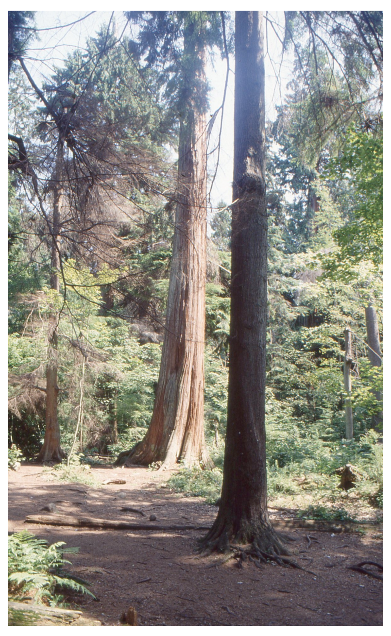
Fig. 5. Red cedar trees (Thuja plicata), on Vancouver Island

being, assumed human form, often by removing his mask or costume, and created the human members of the group" (Codere 1990: 373). These supernatural beings are those represented on crests and totem poles symbolizing the property of each family house. These beings were described in the stories traveling through the world and transforming the landscape and the features of the territory. Sometimes they took off their animal masks revealing their interior human selves, and thus transforming themselves into human ancestors of the numaym members. The latter could thus claim their descent from specific animal ancestors, such as the wolf, the bear, the raven or the killer whale, showing their ancestor crests and wearing the masks transmitted to them by the mythical ancestors.