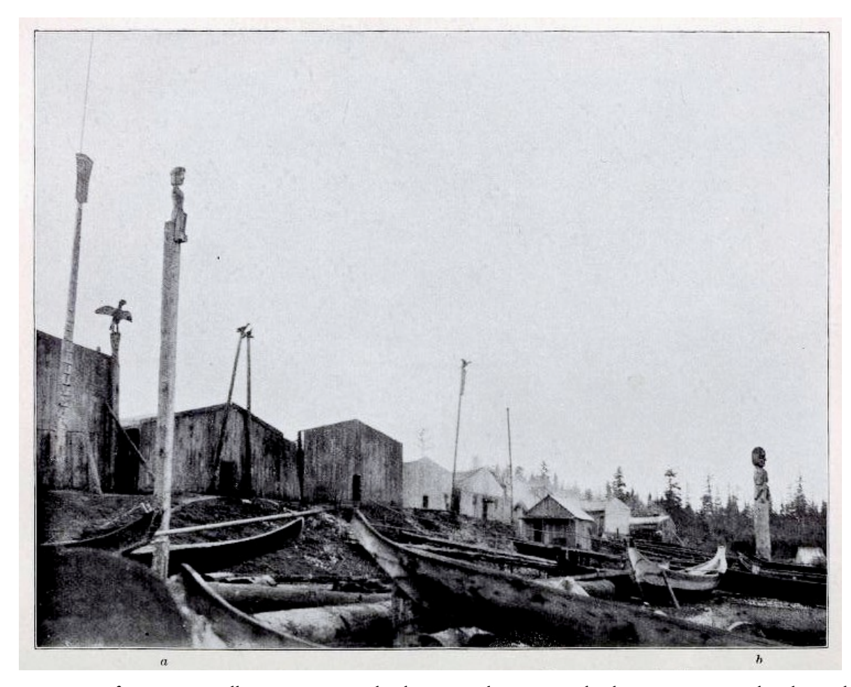
Fig.3. View of Fort Rupert village, Vancouver Island, in 1894, showing wooden houses, canoes, and sculptured posts (from Boas 1897: plate 5)

different Native communities who made them. But generally they represented the ancestors of the family groups or powerful beings who had given their powers or wealth to these ancestors, as it was recorded in legendary tales transmitted within the group.