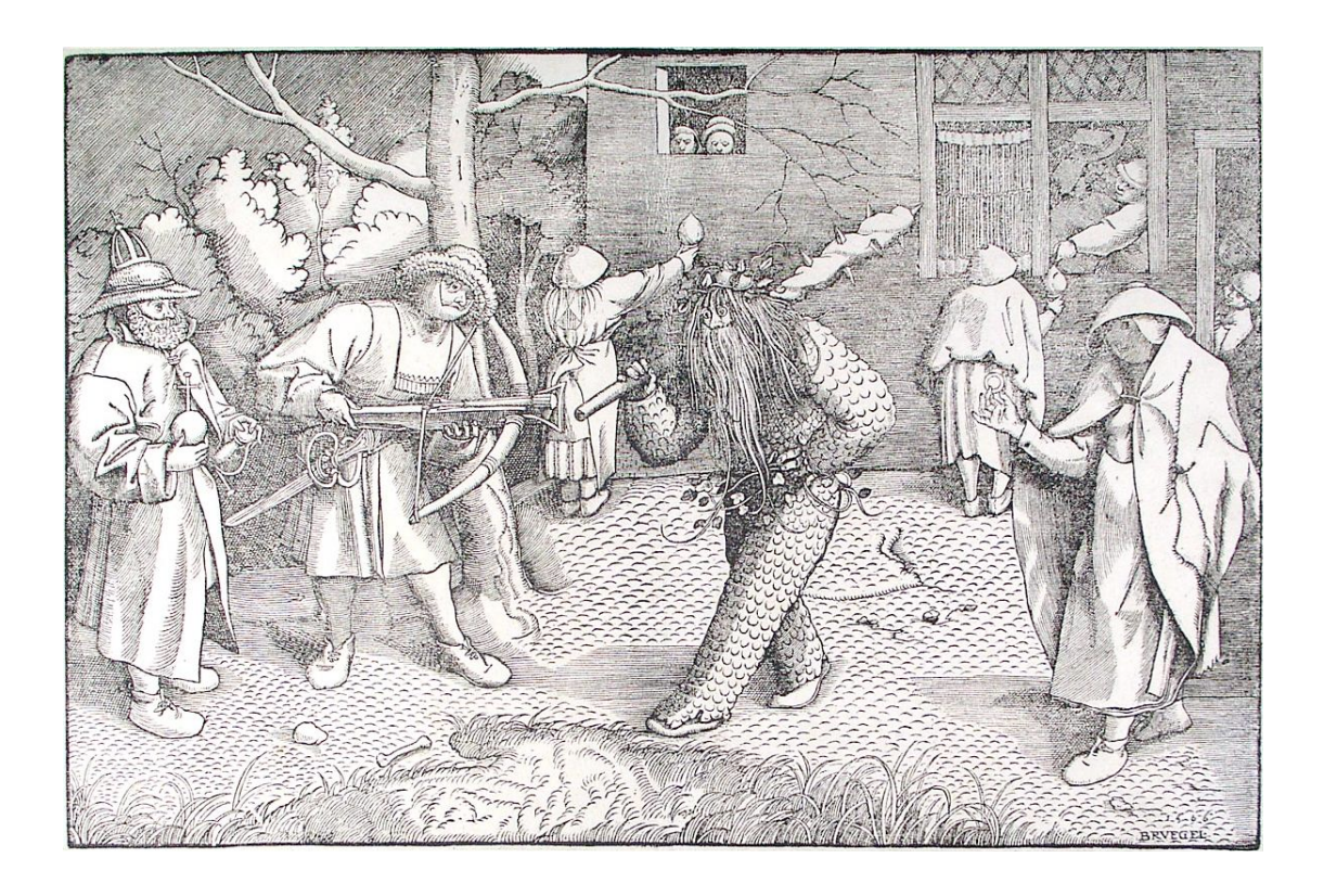
Fig. 15. The Masquerade of Valentine and Orson, woodcut by Pieter Brueghel the Elder, 1566 (from commons.wikimedia.org.)

The conception of a contiguity between humankind and the world of plants seems extremely remote from contemporary sensibility and perception, but in several Carnival performances it is still possible to recover the presence of hybrid figures, showing anthropomorphic traits together with vegetal elements. In this case, too, it is difficult to draw a sharp line between the different figures: the Wild Man often shows a costume made of branches, boughs or leaves, as he was already described in Brueghel the Elder's woodcut (1556) illustrating a popular performance inspired to the legend of Valentine and Orson. In fact, the Bear, a very common character in Carnival masquerades all through Europe, sometimes appears as a "Straw bear" (at Whittlesey, England), as a "Rey bear" (at Valdieri, Cuneo, Italy) or as a "Husk bear" (at Cunico, Asti, Italy).