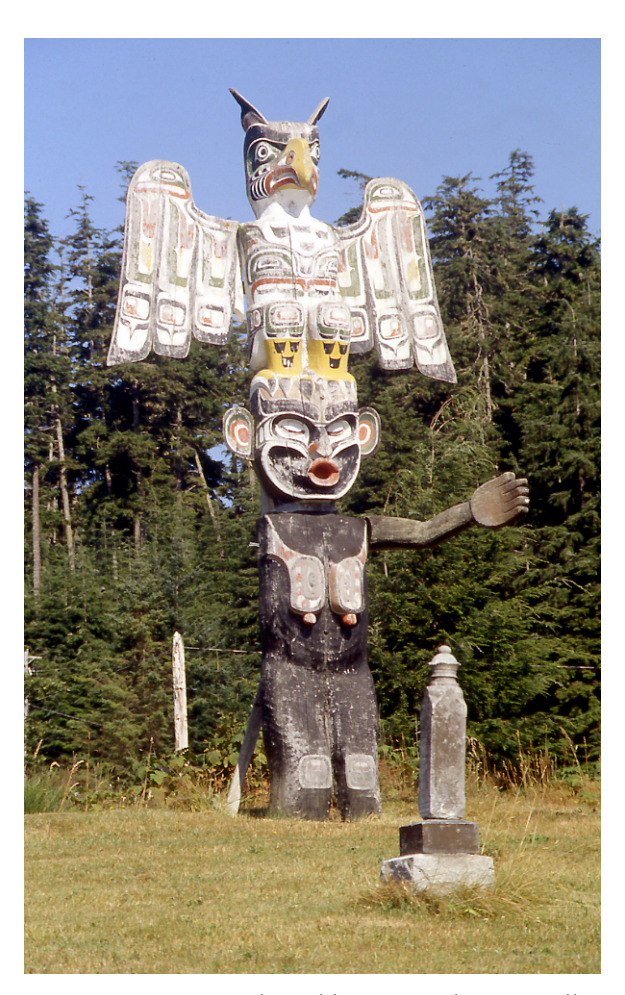
Fig. 10. Totem pole representing Dzonoqwa, the wild woman. Alert Bay village

showing her in the act of giving his guttural call. In the traditional stories, the Dzonoqwa tries to capture children from the human village, putting them in a basket and carrying them to her house in the forest. When young girls or boys walk about in the woods, they are carried away by her, or she entices away children from their home assuming the voice of their grandmothers. That is why Kwakwaka'wakw used to frighten children into obedience by telling them that the Dzonoqwa will come and carry them away (Id.: 145). She is regarded as a cannibal, who roasts and eats the children whom she has stolen.