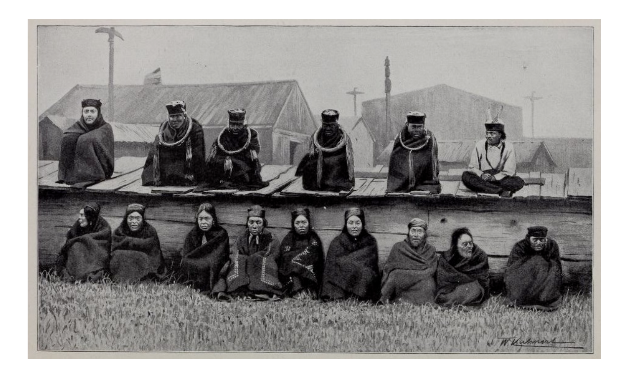
Fig. 7. A group of Cannibal Dancers of the Koskimo, with blackened faces and red cedar bark rings (from Boas 1897: plate 46).