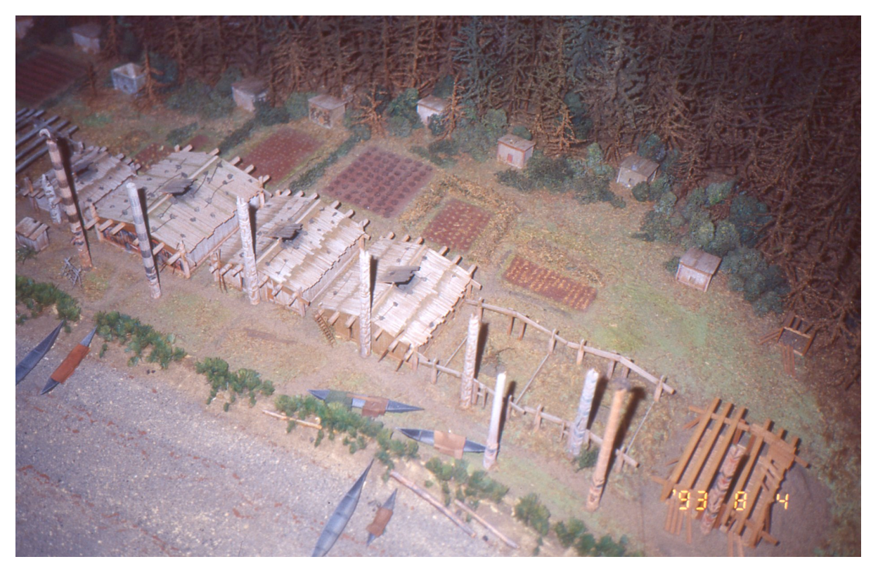
Fig. 2. Model of a North West Coast traditional village, exhibited in the Canadian Museum of Civilization, Ottawa. It shows the houses disposed on a single row facing the seashore, with the forest approaching the rear

Several houses showed on the front some sculptured poles, usually called "totem poles", a unique creation of Northwest Coast art. Some of them served as an entrance to the house, through an opening in their lower part; others were erected beside or outside the building or on a burial ground. The sculptures along the pole represented a variety of superimposed figures, humans and animals alike, which symbolized the various crests the owner could claim. They were memorials of lineage and family traditions, showing the histories of the ancestors of the group and their encounters with powerful and helpful beings in the shape of animals. Usually the topmost figure represented the ancestor of the principal occupant of the building, while the lower ones represented the wife's ancestry, or other heritages which that particular household could boast of. Crests, associated with family histories and legendary traditions, were showed carved or painted on a variety of decorated objects: house posts, wooden boards, dishes, ladles, hooks, boxes, clothing, blankets, and so forth (Bancroft-Hunt 1979: 38-41). They suggested the family's social rank, wealth, inheritance and privileges. Some of the villages along the coast appeared, in the late XIX or early XX centuries, as a forest of totem poles, which counterbalanced the outstanding forest of large trees. The meaning of the designs on these poles is sometimes obscure and difficult to decipher, and varied with the