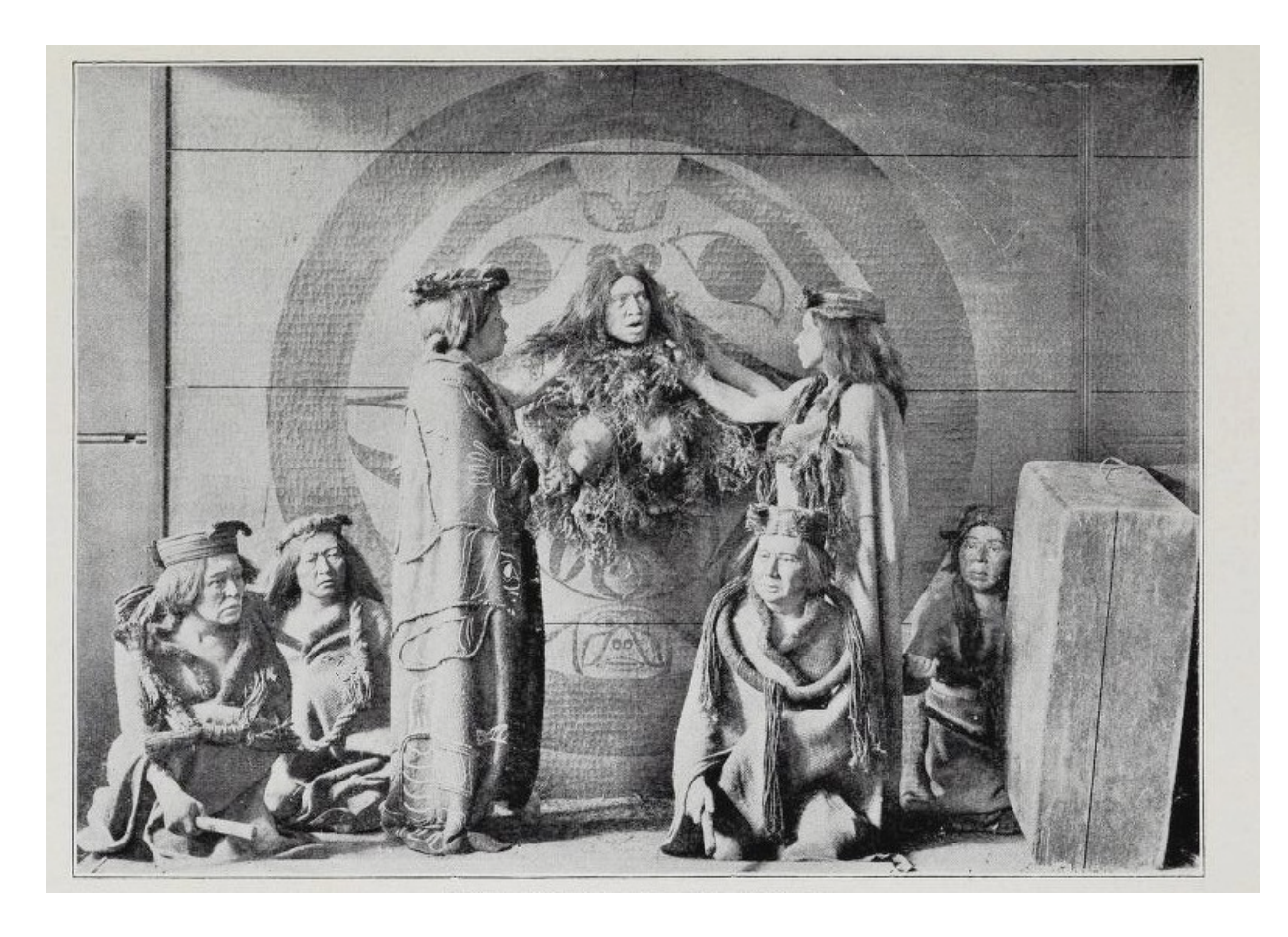
Fig. 8. Cannibal Dancer coming out of the secret room, through an opening painted in the image of the Cannibal Spirit's mouth (from Boas 1897: plate 29)

The two vegetal elements used in the ritual of pacification of the Cannibal Dancer show a remarkable symbolic opposition. The hemlock branches stand for the period of seclusion into the forest and represent the wild and ferocious aspect of the initiate. The cedar bark ornaments constitute the proper costume of the dancer and substitute the hemlock branches in the moment in which the wild force of the initiate is vanishing and he is coming back to his human consciousness and self-control. Among some groups, like the Koskimo, such a dichotomous opposition is revealed by the dance of the initiate: at his return from the woods he dances for four nights wearing the hemlock branches, for four nights without any ornaments and for the final four nights wearing the red cedar bark ornaments (Boas 1897: 455).