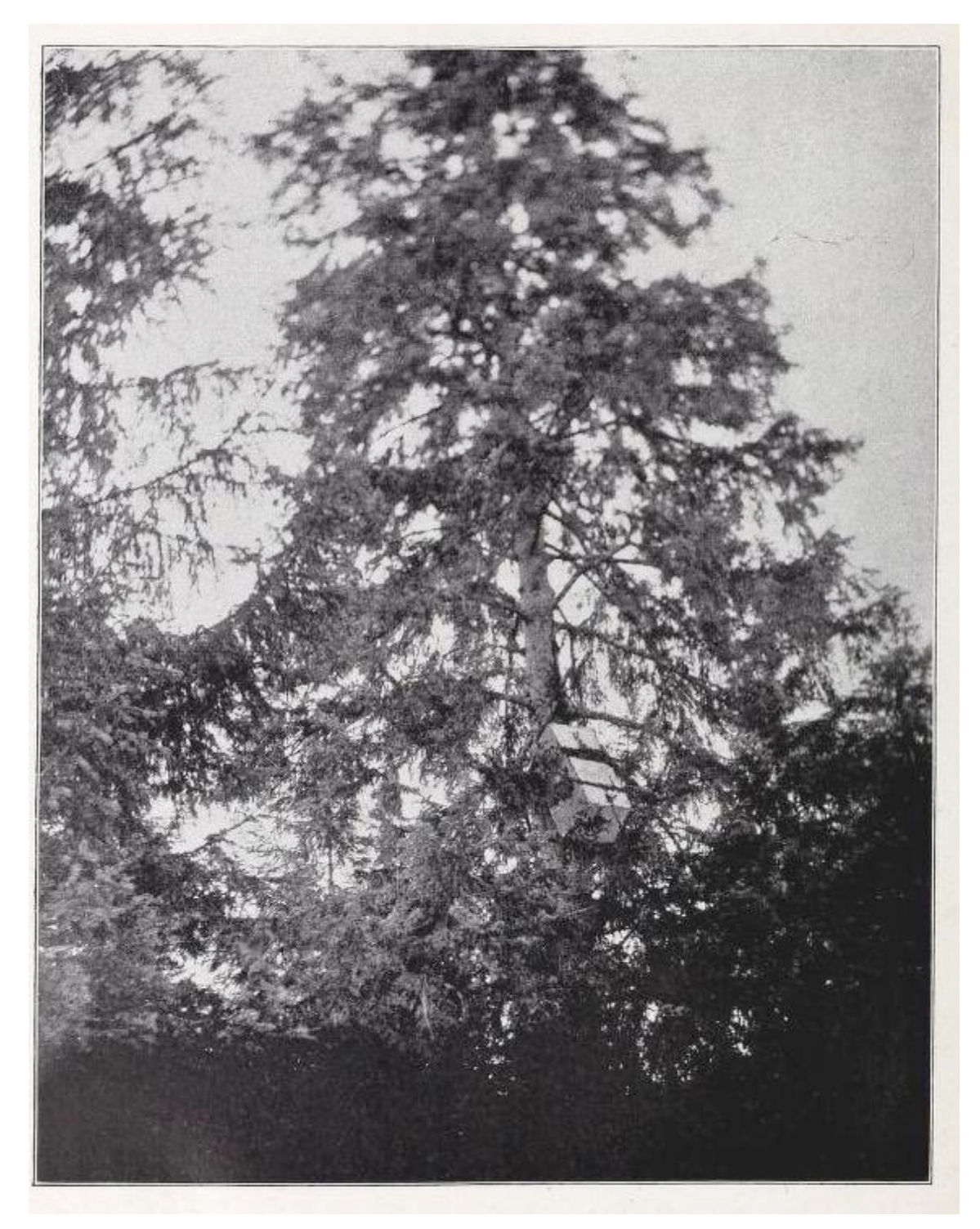
Fig. 12. Tree burial in Fort Rupert, 1894 (from Boas 1897: plate 27)