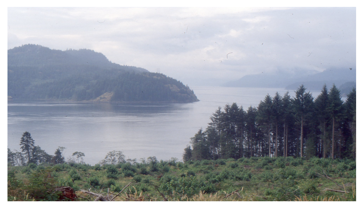
Fig. 1. Scenery from Vancouver Island, British Columbia, Canada, showing the vegetation on the North West Coast

can be from 50 to 70 m. tall and with a diameter from 3 to 4 m. The Native peoples of the region used plants for a variety of purposes: as sources of food, as materials used in the construction of houses and other implements, as medicines, fuel, and for making ropes and baskets (Suttles 1990: 20-24).