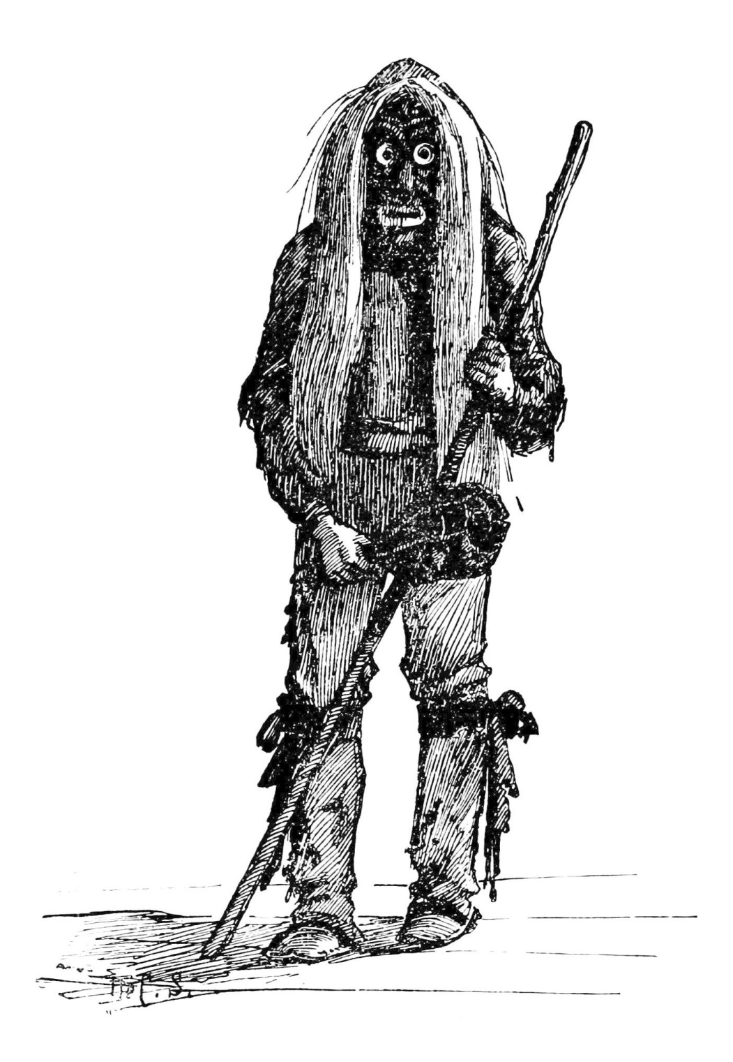
Fig. 14. An Iroquois dancer with costume and mask of the False Faces Society