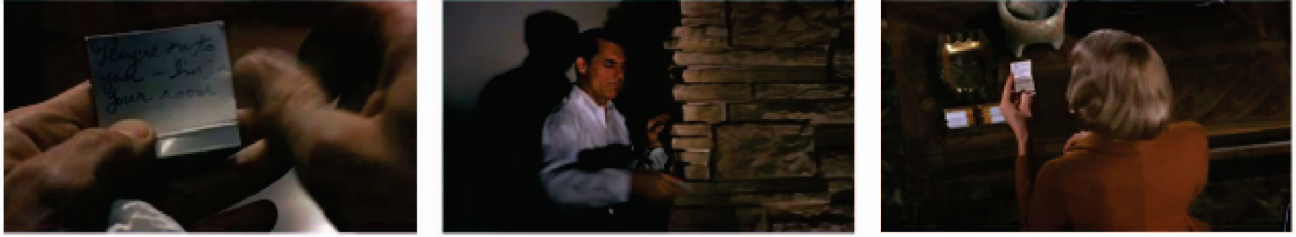
Figure 1. Three frames of the matchbox scene in North by Northwest.

bourbon, box, city, dress, dritte, drunk, Eva, girl, matchbox, mother, Mount, office, peak, Philip, plane, police, Roger, Rushmore, searchers, secretary, skirt, station, studio, suit, sunset, tunnel, unsichtbare, waterfront, woman. Most tags refer to characters (“Roger”, “mother”) or their qualities (“blonde”, “dress”). According to the structural ontology (see details in [5]), the content tags of the scene above could be referred to: