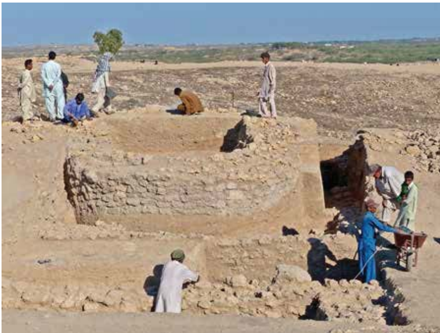
Fig. 5. The 2014 Pakistani-Italian sounding.

The geomorphological and hydro-logic survey and sedimentological investigations and tests carried out during the 2014 season have advanced our knowledge of the changes in the Indus’ course and helped us achieve a better