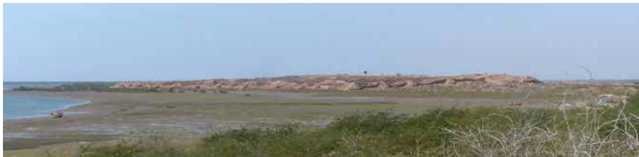
Fig. 1. Banbhore seen from the east.

The excavations carried out by the late Fazal Ahmad Khan (1958-1965) revealed important architectural and archaeological remains of a pre-Islamic and Islamic settlement (Khan 1969). The latter was represented by a Mosque, a Hindu Temple, houses, palaces, workshops and warehouses, market and “industrial” areas. Various kinds of objects such as Chinese porcelain and celadon, Indian artefacts, clay honey-combed moulds, coins, beads and glassware were found, witnessing the wealth and importance of Banbhore in the Islamic age. Skeletons left unburied inside the houses and on the streets were also found,