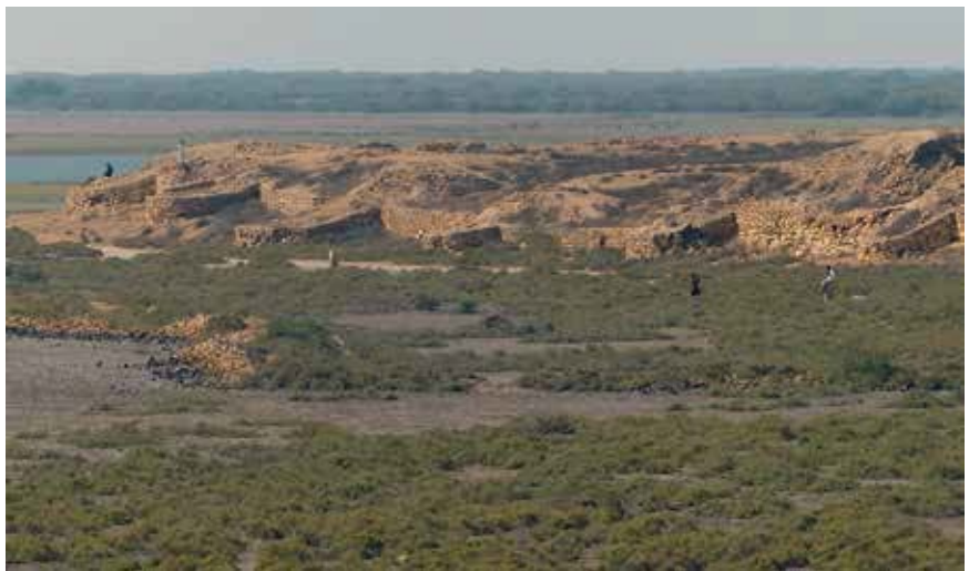
Fig. 3. The so-called "Partition Wall" running across the citadel, seen from the north.

The importance of the site is undoubtedly linked to its strategic position and the surrounding environment. The imposing remains are a clear testimony to the major role it played in the course of centuries. In various periods of its life it would seem to have been a nerve-junction of the Indus system, the northern terminal of the monsoon routes, and the center of a prosperous trade of luxury goods between the Central Asian basin and the Iranian plateau, Arabia and the Indian Ocean all the way to China in the East and the major markets in the West. Its location along a branch of the Indus River – the Gharo channel – could provide excellent shelter for all convoys arriving there from North and South, loaded with precious merchandise to bargain, to sell and purchase. The favorable environment, if properly irrigated by means of human intervention, could provide agricultural resources which must have formed a formidable economic backbone of the city, providing passing caravans and convoys with fresh supplies too.