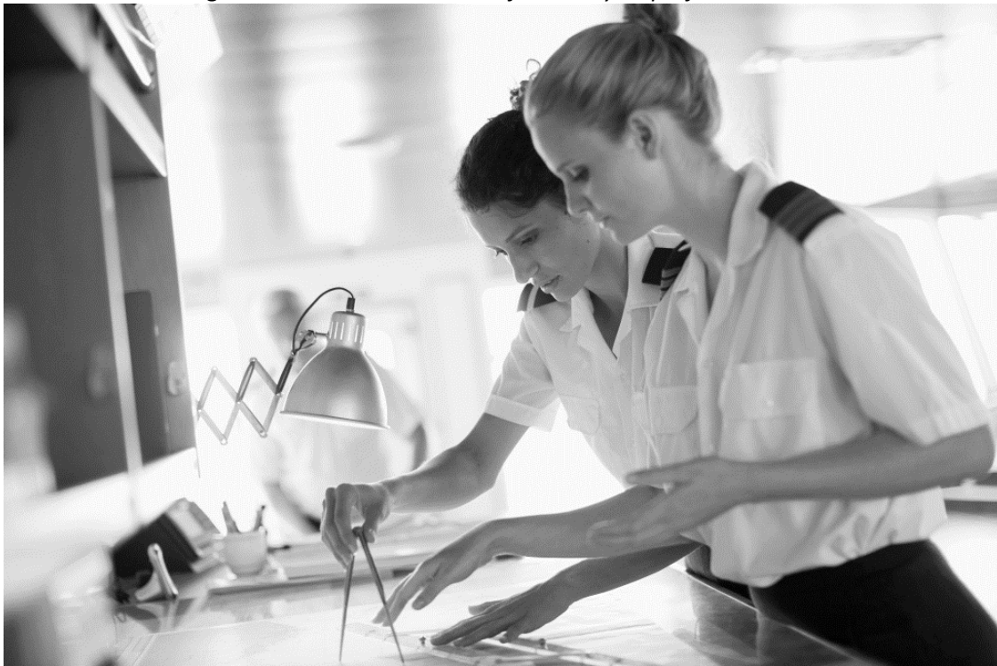
Figure 5 – Counter-narratives: femininity as professionalism