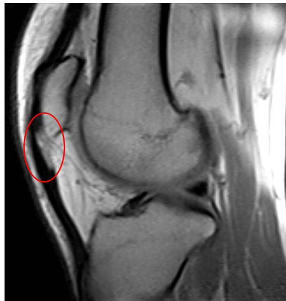
Figure 1. Magnetic resonance imaging caption showing insertional patellar tendinopathy (red circle).

The lack of basic knowledge on the aetiology and pain mechanisms associated with patellar tendinopathy is reflected in the existence of many different treatment protocols. 15 The aim of this section is to analyse the different possible treatments described in recent literature.