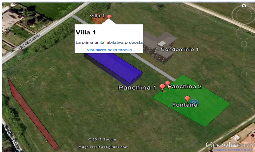
Fig. 2. Zoom on a portion the community map displaying 3D models.

The “Nuovo contenuto” (new content) link at the top of the page can be used to (i) create or upload a new document; (ii) upload a 3D model from a repository (e.g., a KMZ model), or (iii) draft a new 3D item by means of an editor which allows to sketch broken lines and polygons, select color and height of items, move, orientate and resize them, and set metadata. The right portion of the page displays items in a checkable list which allows the user to further select the elements to be shown in the map and to interact with them: e.g., open/edit documents or zoom the map on 3D objects (through the title), view the list of associated comments or add new ones (“Visualizza / aggiungi commenti”). The list also includes documents which cannot be visualized in the map because they are not geo-referenced.