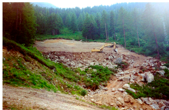
Figure 1. Ski-run construction below the treeline in the Italian Alps.

In Europe, the treeline oscillates around 2000 m above sea level. Surface corrections below that limit mainly affect forest soils (Figure 1), while at higher elevations geomorphological features such as rock glaciers or patterned ground areas are disturbed, although the disturbance of soil properties and alpine vegetation also have to be considered (Figure 2). Machine-grading is a common practice at all elevations in the Alps and, in comparison to clearing is more damaging to multiple indicators of ecosystem functions [16]. The impact on soil properties observed in graded ski runs may be especially long-lasting in high-elevation ecosystems where soil development tends to be slower. Nevertheless, if best practices for soil management are carried out, the ski-runs can be successfully used for grazing during the summer months.