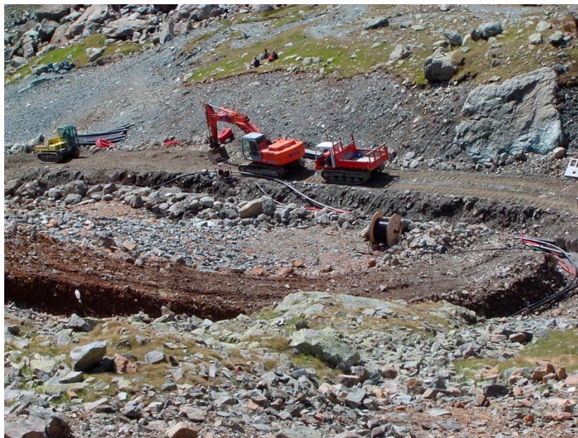
Figure 3. Construction of artificial snow-making system above the treeline in the Italian Alps.

The reduction in ski season length due to climate change could be mitigated if artificial snowmaking is employed [19]. However, the economic limits of snowmaking are still poorly understood and potential increases in energy price and/or shortage of fossil fuels could affect the profitability of snowmaking [19]. This encourages new areas of research to be developed in order to better understand the winter tourism system.