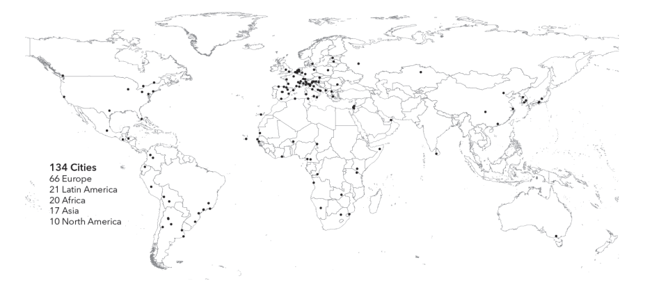
Figure 1: The 134 Signatory Cities of MUFPP