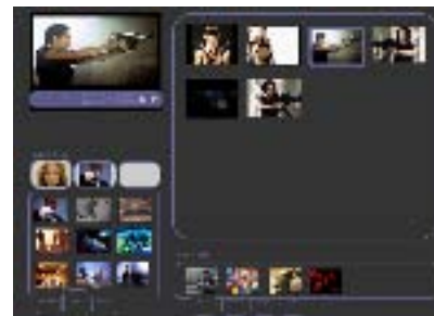
Figure 1: mash up tool main window

navigation interface to explore contents with a video editing interface favouring the visual communication rather than the textual one [21]. Users can query the repository of clips through three different variables that are the topos, the celebrities and the "stilema". Topos represent the narrative places, that is cyclic themes universally recognized as belonging to a well-defined genre, like for example the gunfight, the countdown, the robbery and the explosion in the action genre. Celebrities represent the motion-picture actors, the most famous and most recognizable in the cinematic world. The "stilema" represent predetermined visual styles established analyzing the different styles occurring in the history of cinema or directly linked to the genre culture (e.g. the "fear stilema" is characterized by nocturnal colours and a nervous editing style and camera movements).