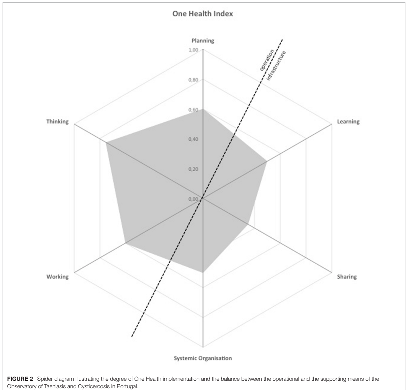
FIGURE 2 | Spider diagram illustrating the degree of One Health implementation and the balance between the operational and the supporting means of the Observatory of Taeniasis and Cysticercosis in Portugal.

The OH index was 0.31. Its OHR is 1.98. The results were depicted in a spider diagram with the surface area and shape illustrating the degree of OH implementation and the balance between the operational and the supporting means ( Figure 2 ). The operational levels of the Initiative are the main strengths, namely, OH thinking and OH working, indicating a comprehensive multidimensional approach and transdisciplinarity. On the other hand, weaknesses