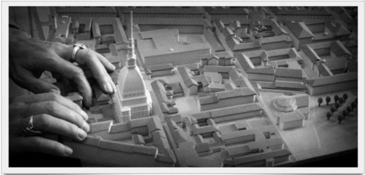
Figure 1. Detail of the map.