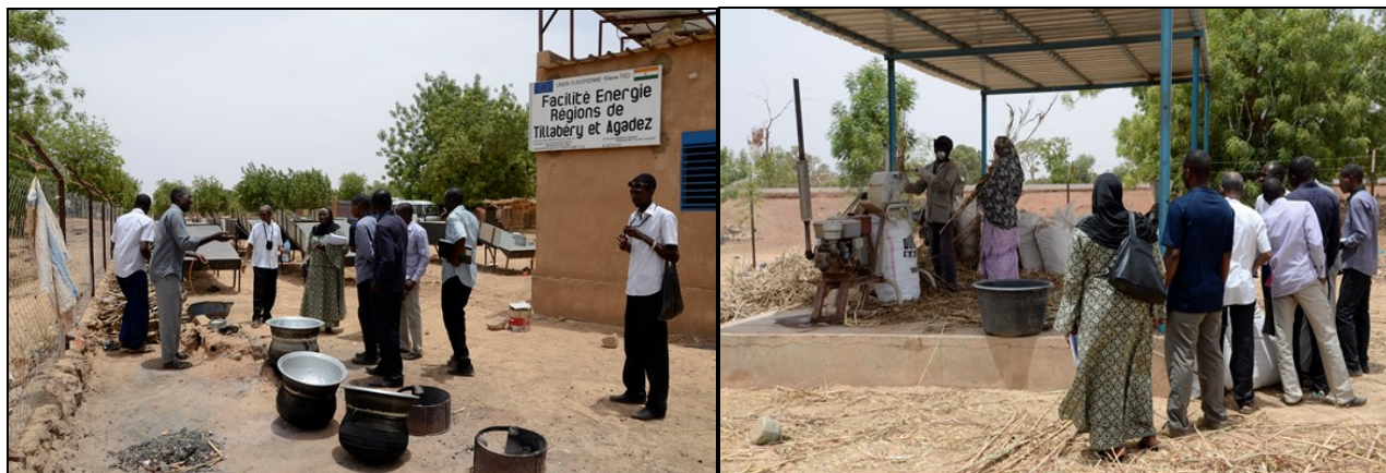
Figure 2 – Study visit to the centre for the improvement of energy production and use (Region of Tillabéri), by P. Barge

protection (Semita et al., 2014b), with the aim to enable them to face the challenges and constraints of rural development and to take into account the links between the different themes (Figures 2, 3 and 4).