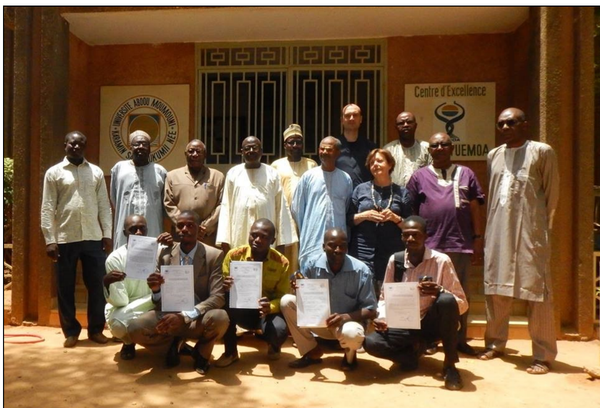
Figure 7 – The international Commission of the Master evaluated the candidates after their final dissertation, by B. Mola.

The titles of the thesis of the students who have concluded the first edition of the Master are listed in Table 2.