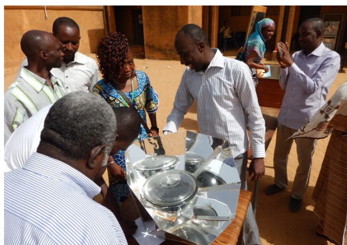
Figure 4 - Practical courses to test the effectiveness of solar ovens and the possibility of reducing and contrasting deforestation, by P. Barge.

The first edition of this Master began in February 2015 in accordance with the calendar of the University of Niamey. The program, included in the didactic offer of the Faculty of Agronomy and the Regional Centre for Specialized Education in Agriculture (Cresa), has been recognized by the African and Malagasy Council for Higher Education (Cames). The issued diplomas are valid in all the countries of Africa. The training program consisted of 20 teaching modules (Table 1) in a period of six months (30 credits), which involved the participation of 49 teachers from six different nationalities (Niger, Burkina Faso, Chad, Mali, France and Italy) and one period of six months of field training (30 credits).