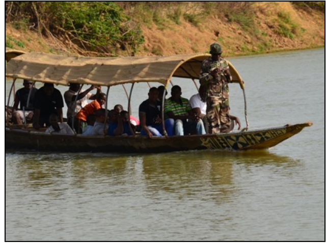
Figures 5 and 6 – Field trip to protected areas: the students’ visit was guided by the teachers and staff of the W National Park.

The Master enrolled 10 students (5 Nigeriens, 3 Chadians, 1 Togolese and 1 Burkinabe, 1 woman, 9 men), with various specializations (agronomists, biologists, geologists, etc.). All participants have duly completed their study course by obtaining their Master's degree between April and July 2016 (Semita et al., 2017).