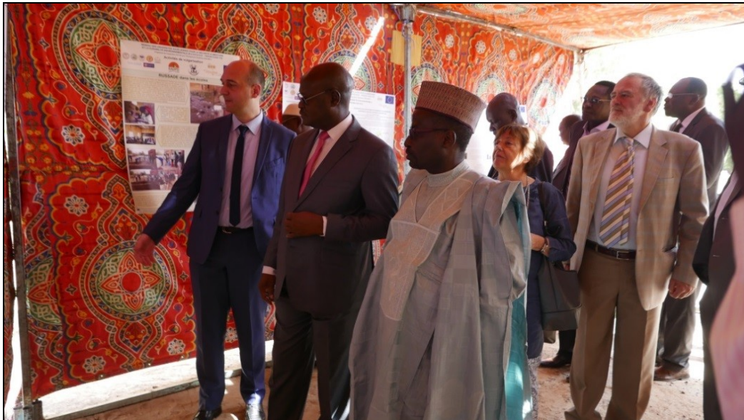
Figure 8 – Closing workshop of the project in N'Djamena (Chad). Visit of the delegates to the posters exhibit, by P. Barge.

(Chad), where a synthesis of each dissertation (AA.VV., 2017a) was proposed in a poster exhibition (Fig. 8).