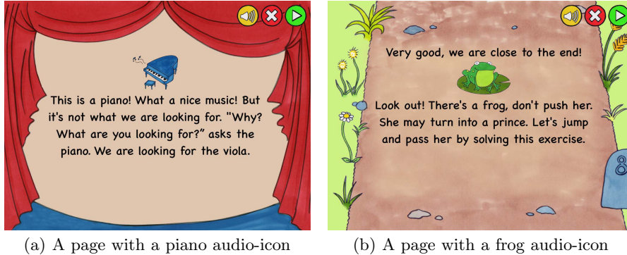
Fig. 2. Two pages of MathMelodies story

Overall, the tale and the audio-icons have also the objective of triggering children's interest. This is similar to the approach adopted in most textbooks that heavily rely on colorful images. The difference is clearly that in MathMelodies this solution works for visually impaired children too.